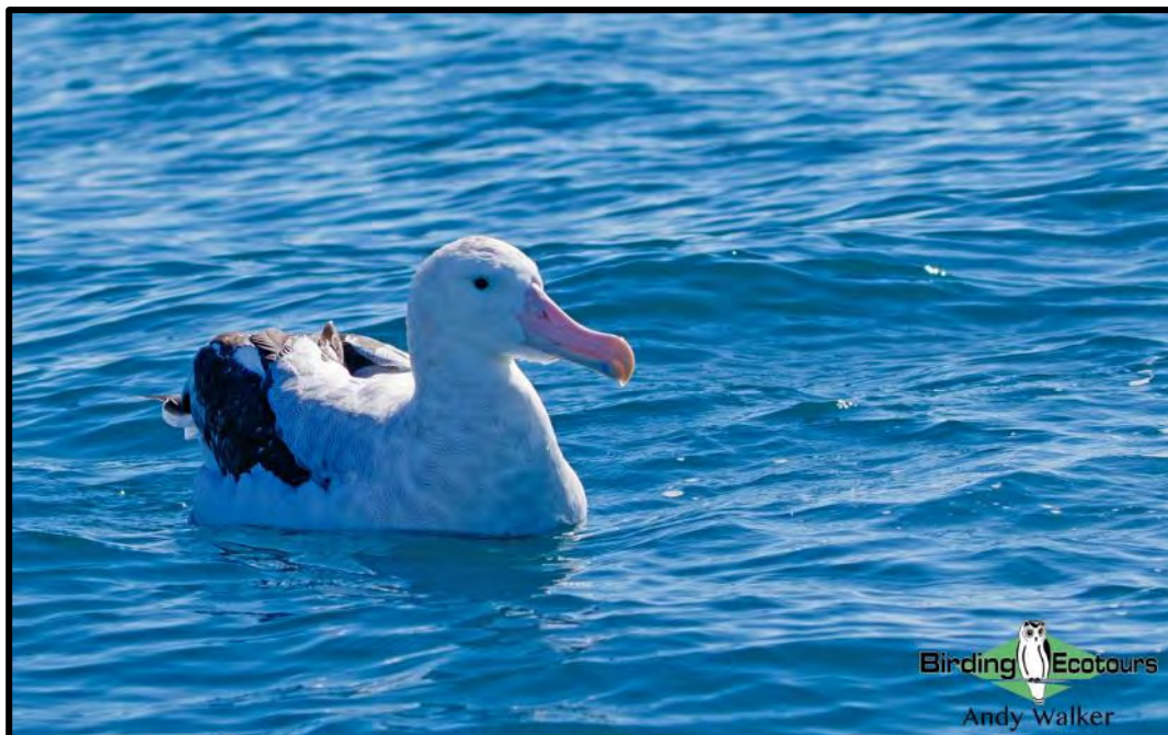
Wandering Albatross was a good record for the pelagic.

Two Northern Royal Albatrosses came in, one eventually sitting close to the back of the boat, with the other keeping its distance. A single Shy (White-capped) Albatross came in briefly, with a couple of others noted as we were transiting, but they seemed less bothered about our presence