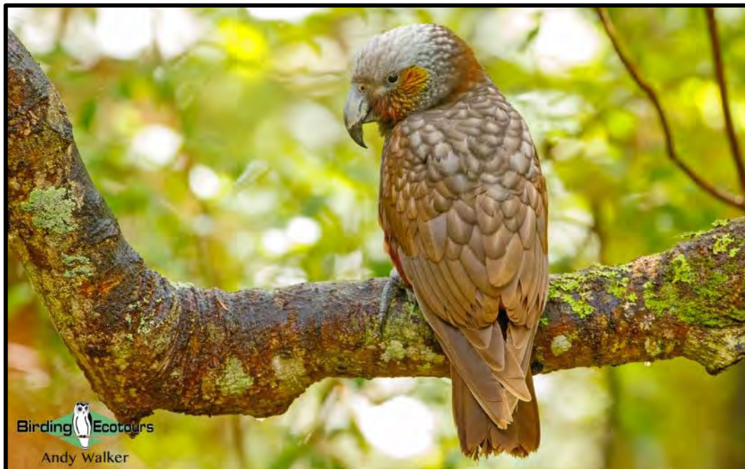
New Zealand Kaka is a large, endemic parrot that makes some remarkable sounds.

As soon as the boat pulled into the tiny harbor on Ulva Island we noted South Island Robin waiting there to welcome us, along with a huge bull New Zealand Sea Lion . As we got our bearings and sorted out our gear we became aware of a Weka (a flightless rail) literally right beneath our feet, totally unconcerned by our presence. As we started our hike we found the huge New Zealand Pigeon sitting low in a giant tree. Over the course of the next couple of hours we found many of our target birds, such as Red-crowned Parakeet , Yellow-crowned Parakeet , New Zealand Kaka , Pipipi (New Zealand Creeper), Yellowhead , Grey Gerygone , Morepork , New Zealand Bellbird , Tui , Tomtit , New Zealand Fantail , and South Island Saddleback . Most of the birds seen were extremely approachable and gave great views. Furthermore the primeval forest was a real joy to walk in, and one could imagine what much of New Zealand must have been like in years gone by.