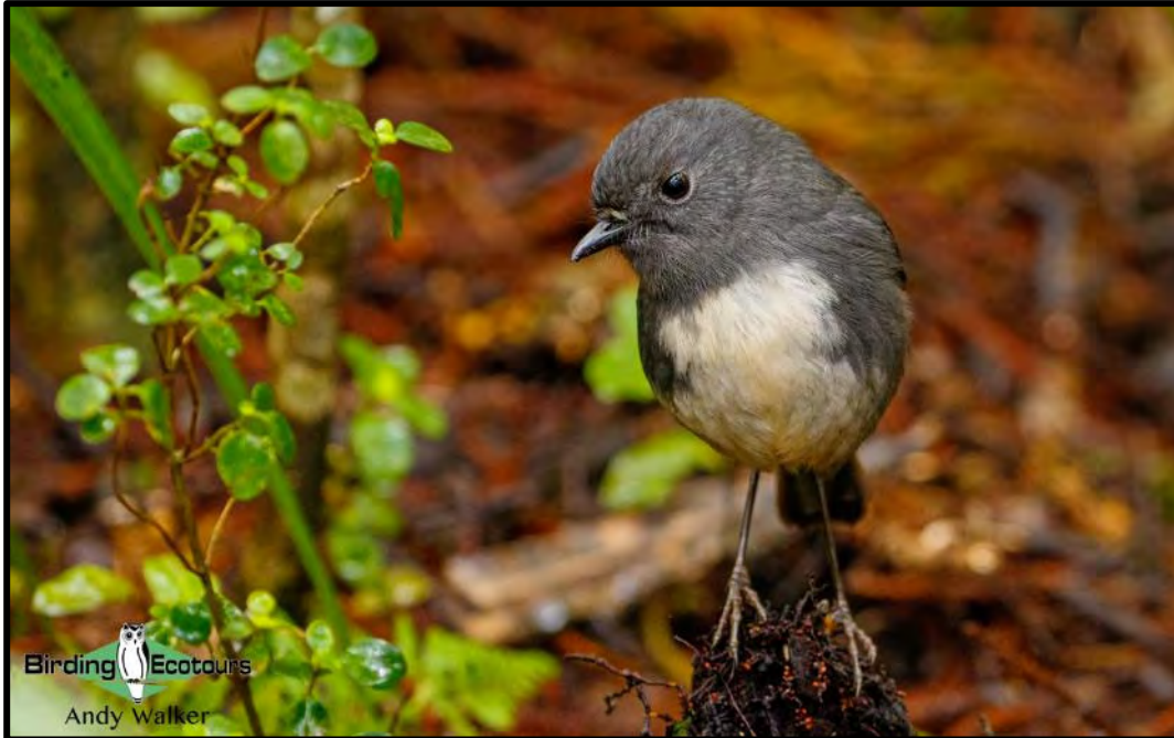
South Island Robin is extremely confiding!