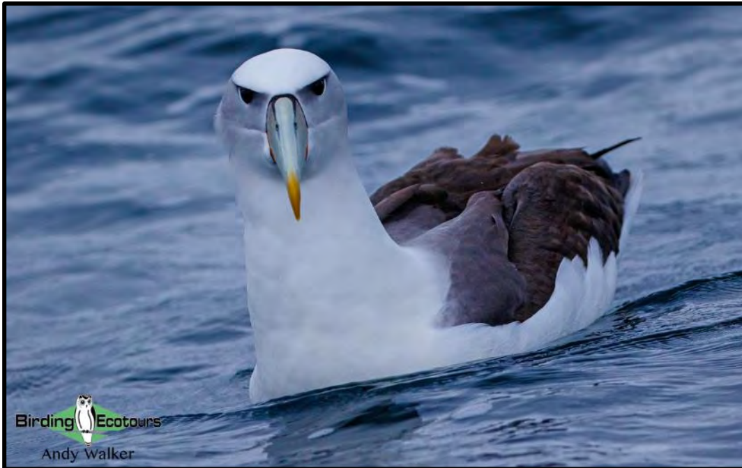
The New-Zealand-breeding subspecies of Shy Albatross is split by some authorities and called White-capped Albatross . It's easy to see why in this picture.