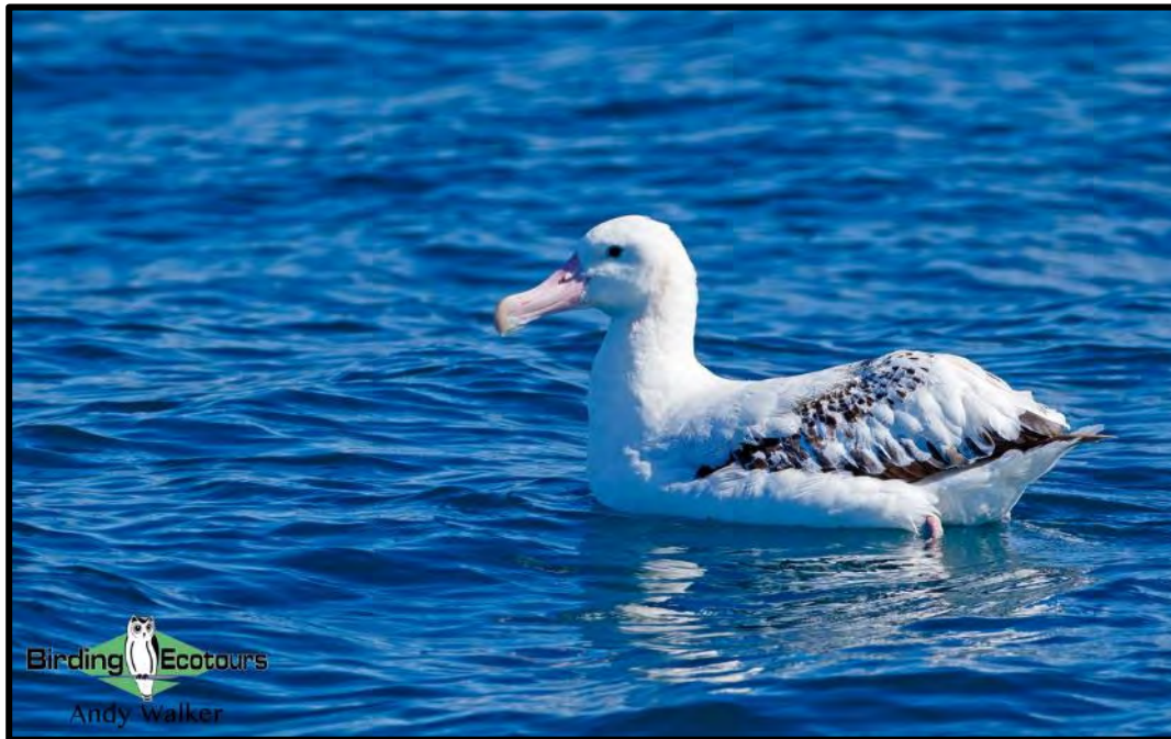
Antipodean Albatross was present on the pelagic trip.

close, a Grey-faced Petrel performed a fly past, and several boisterous Northern Giant Petrels jostled for position with several Antipodean Albatrosses and one Wandering Albatross .