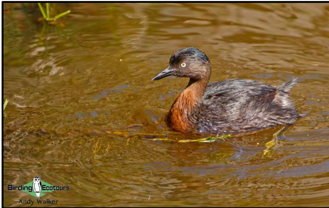
New Zealand Grebe.... pretty cool to get a lifer while in Hobbiton!

A non-birding day exploring the Lord of the Rings and Hobbit film set 'Hobbiton' near Matamata. It was a great site to explore, and we had the bonus of a pair of New Zealand Grebes on the village pond outside the Green Dragon Pub!