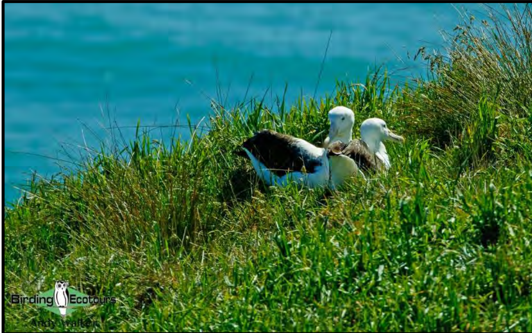
A unique opportunity to observe Northern Royal Albatross on land!

As the afternoon drew on we had one final stop at a private reserve, where we learned about and then saw five of the Endangered (IUCN) Yellow-eyed Penguins , a species in rapid decline globally and a real privilege to see. While here we also saw a couple of the much smaller Little Penguins that were also nesting in the area. A New Zealand Sea Lion was loitering on the beach too, presumably looking for a penguin-shaped dinner snack... As far as first days of a tour go, this was a pretty great start!