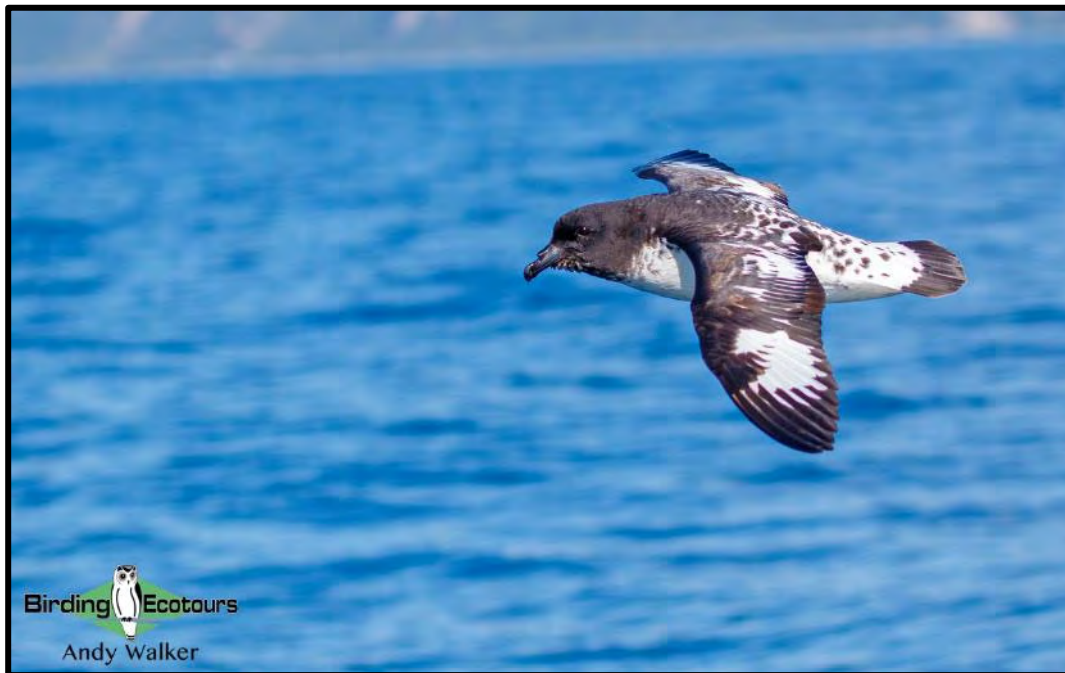
Cape Petrel was a constant feature on the boat trip.

We took a morning boat trip into the bay at Kaikoura. We didn't have to go far before we started to see some good birds, with Caspian Tern in the harbor, quickly followed by a small flock of White-fronted Terns , our best view to date. As we left the harbor we found our first raft of Hutton's Shearwaters in much lower numbers than the previous evening but much closer. A little farther and we were suddenly watching Northern Giant Petrel and Cape Petrel , from none to about forty of the latter in no time at all.