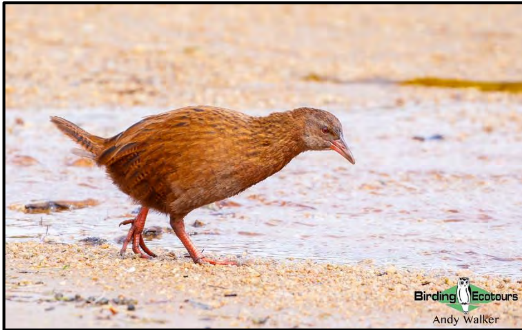
Weka - another confiding, flightless bird living on the edge

On arrival at Milford Sound the clouds were down, and the view was not as spectacular as we had hoped. However, twenty minutes later, after we had been enjoying views of Weka , Tomtit , and New Zealand Bellbird , the sun came out and the clouds shifted, giving us some seriously spectacular views of the lake and mountains. A tour highlight in its own right!