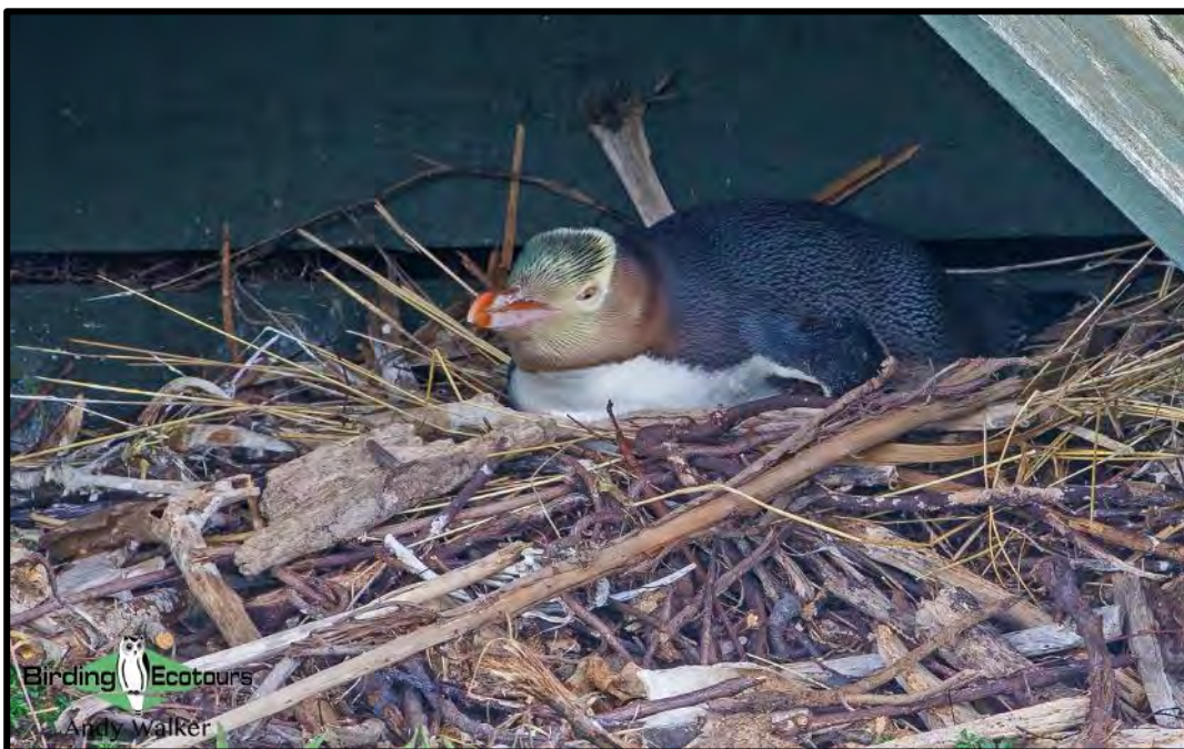
It was a real privilege to observe nesting Yellow-eyed Penguin .

As the afternoon drew on we had one final stop at a private reserve, where we learned about and then saw five of the Endangered (IUCN) Yellow-eyed Penguins , a species in rapid decline globally and a real privilege to see. While here we also saw a couple of the much smaller Little Penguins that were also nesting in the area. A New Zealand Sea Lion was loitering on the beach too, presumably looking for a penguin-shaped dinner snack... As far as first days of a tour go, this was a pretty great start!