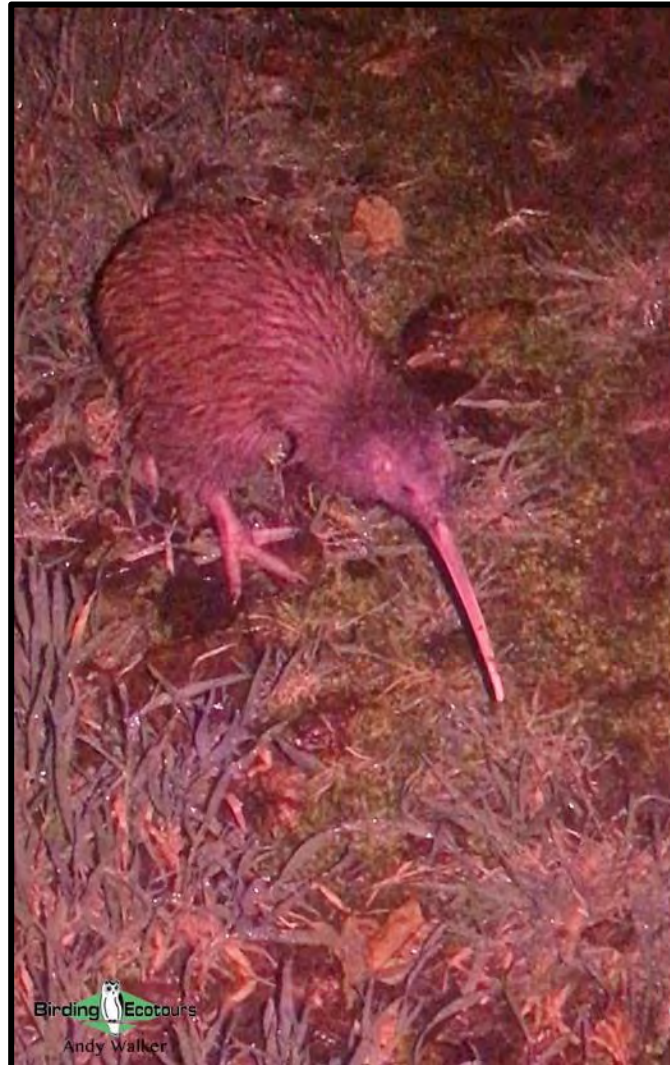
Southern Brown Kiwi gave outstanding views as one walked right up to us! (iPhone video-grab)

a kiwi), flightless, ancient bird. It was a real privilege to get such amazing views of a pair of birds. Just as we were leaving the area we were treated to a wonderful, clear, southern starry sky.