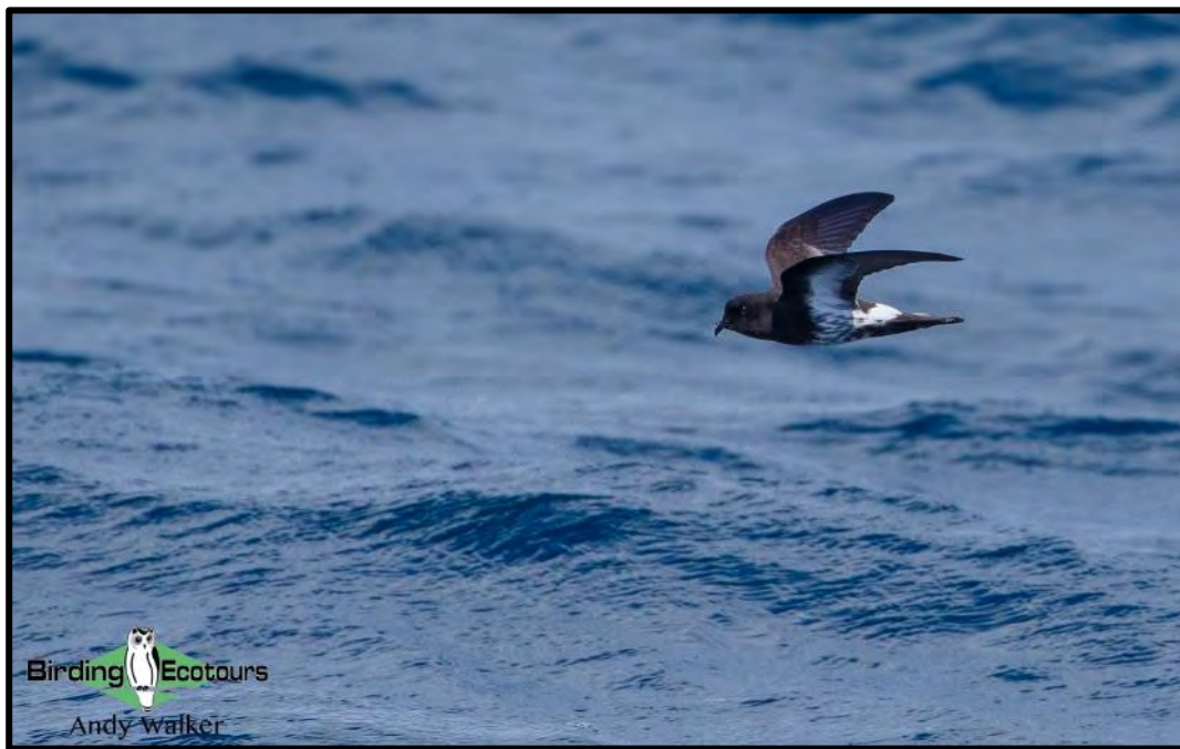
The main target of our pelagic trip was the Critically Endangered (IUCN) and very locally distributed endemic New Zealand Storm Petrel.

We stopped off at a couple of islands along the way, finding Weka , New Zealand Kaka , Tui , Paradise Shelduck , and Indian Peafowl . New Zealand Plover , Royal Spoonbill , and Bar-tailed Godwit were present on the beach as we came back into the harbor.