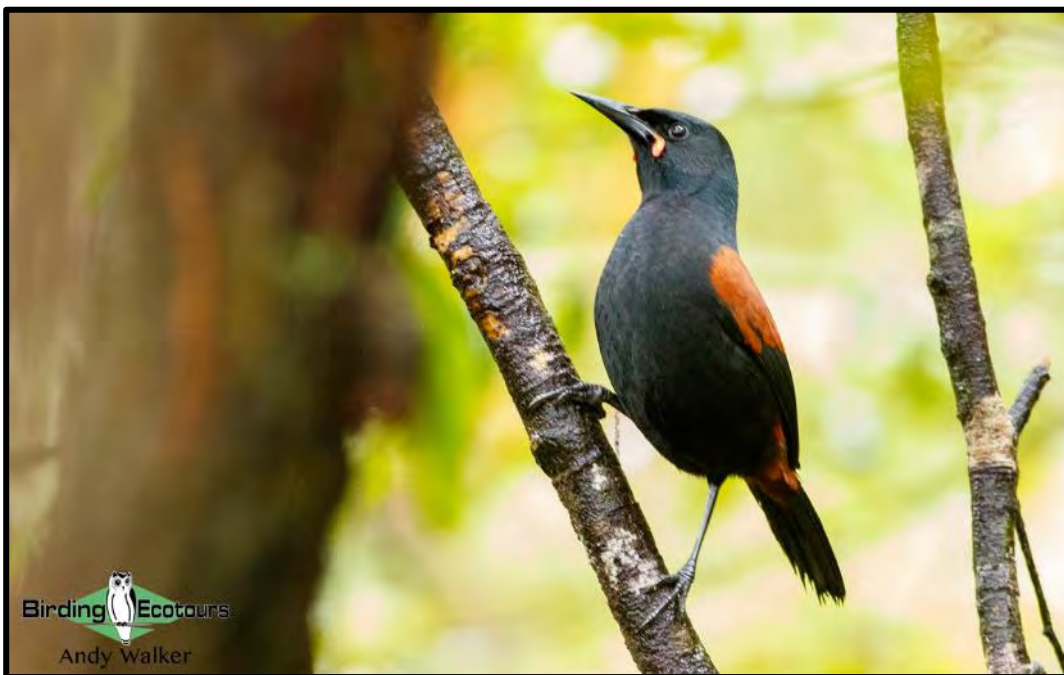
South Island Saddleback was a highlight bird for us during the afternoon, along with a flock of Yellowhead and Pipipi.

Several other birds were noted as we made our way around the island, such as White-fronted Tern , Variable Oystercatcher , Paradise Shelduck , and Spotted Shag .