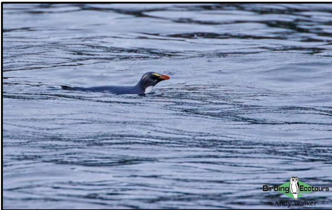
Fiordland Penguin was a bonus bird as we were looking for albatross.

As we walked to and from the boat jetty from our accommodation we found several endemic and introduced birds, highlights being Tui , New Zealand Pigeon , New Zealand Kaka , Grey Gerygone , New Zealand Fantail , New Zealand Bellbird , Variable Oystercatcher , and Paradise Shelduck .