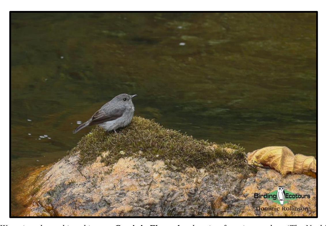
We enjoyed watching this cute Cassin's Flycatcher hunting from its perch at 'The Neck'.

Further down we stopped at some mid-elevation forest which is known as 'The Neck'. Here we found further good birds in the form of African Black Duck, Black Bee-eater, Plain and Redtailed Greenbuls, Green Hylia, Mountain Wagtail, Cassin's Flycatcher, Black-faced Rufous Warbler and Grey-headed Sunbird. The remainder of the drive to Buhoma was fairly quiet and we arrived at our lovely lodge in the late afternoon and enjoyed a delicious meal to cap off the day.