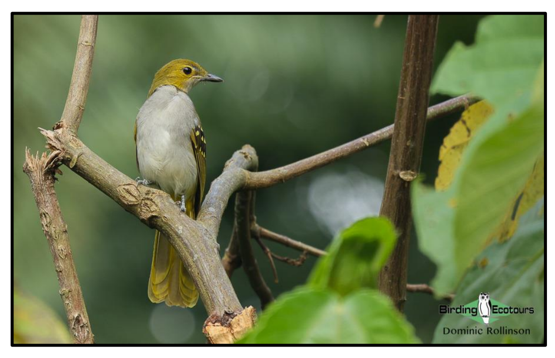
We had good looks at Western Nicator at Bigodi Swamp.