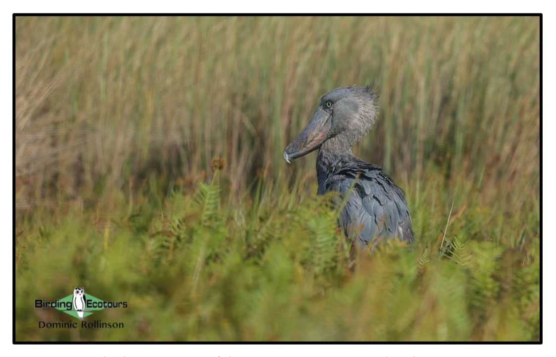
We had great views of the iconic Shoebill in Mabamba Swamp.

This morning included our much-anticipated boat trip on Mabamba Swamp to connect with perhaps the most desired target bird of any trip to Uganda – the prehistoric-looking Shoebill. We left Entebbe before sunrise and arrived at the swamp not long after sunrise and headed out on three motorized boats in search of quarry. It didn't take long before word of a nearby Shoebill spread and we headed off towards a very tight channel. Unfortunately, only two of our boats could squeeze down the channel for point-blank, full-body views (with the other boat enjoying good head views only) of the mighty Shoebill before it took flight to another section of the swamp. Our drivers managed to track it down again and we had further views and later on had close-up flight views. A great way to start our Uganda birding tour! While navigating through the various channels and bays of the swamp we added a number of waterbirds and water-associated species such as African Marsh Harrier, White-faced Whistling Duck, African Swamphen, Long-toed Lapwing, African Jacana, White-winged Tern, Squacco, Grey and Purple Herons, Great, Intermediate and Little Egrets, Blue-headed Coucal, Winding Cisticola, and a number of beautiful Bluebreasted Bee-eaters. Overhead we encountered several aerial feeders such as African Palm. Little and White-rumped Swifts, White-headed Saw-wing, Banded Martin and Grey-rumped, Angolan, Barn and Red-breasted Swallows.