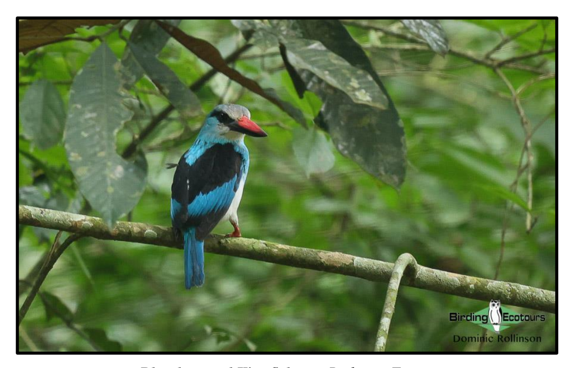
Blue-breasted Kingfisher in Budongo Forest.

morning here and enjoyed our lunch in the shade of the massive trees which make up this impressive forest. Over the course of the morning, we managed to find White-thighed Hornbill, Chestnut Wattle-eye, Brown-eared and Yellow-crested (Golden-crested) Woodpeckers, Little Grey and White-throated Greenbuls, Chestnut-capped Flycatcher, Rufous-crowned Eremomela, Fraser's Rufous Thrush, Fraser's Forest Flycatcher and Green Twinspot. Kingfishers were omnipresent in the forest and we had multiple looks at African Pygmy Kingfishers, good looks at a single Blue-breasted Kingfisher, brief views of African Dwarf Kingfisher, but could not get onto the many vocal Chocolate-backed Kingfishers. Small groups of the unusual Spotted Greenbul kept us entertained as they flew about and occasionally lifted one of their wings, a curious and distinctive behaviour of this species. We also spent some time luring out a White-spotted Flufftail which everyone managed to get brief looks at – comparatively good looks for a flufftail!