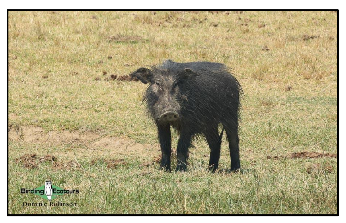
Giant Forest Hog showed well for us along the Kazinga Channel.

Immediately after finishing our drive along the Kasenyi track, we headed to the Kazinga Channel where we boarded our boat and had a thoroughly enjoyable two-hour boat cruise with hordes of mammals coming down to drink along the water's edge and many new and exciting bird species too. On the non-avian front, we had many impressive African Elephant, large groups of African Buffalo, wallowing herds of Hippopotamus, and protracted views of a single Giant Forest Hog which were improvements upon the previous evening's brief glimpses. We had excellent views of many water-associated species such as African Skimmer, Grey-headed Gull, Yellow-billed Stork, African Openbill, Brown-chested Lapwing, Common and Wood Sandpipers, Striated, Squaccco, Goliath, and Grey Herons, Great White and Pink-backed Pelicans, Red-throated and Olive Bee-eaters, Malachite Kingfisher as well as the literally hundreds of Pied Kingfishers. A single Copper Sunbird was also seen which turned out to the only sighting of the trip!