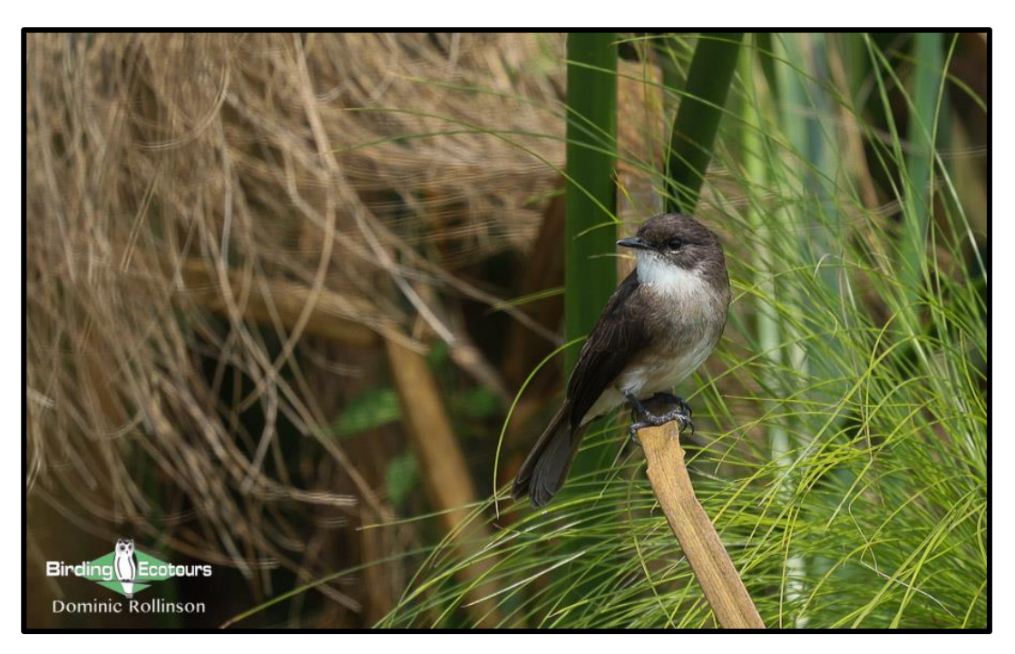
Swamp Flycatcher , one of the many papyrus specials we encountered.

After checking into our accommodation, we did some relaxed birding around our lodge which again proved productive, with sightings of Swamp and Northern Black Flycatchers, Greenwinged Pytilia, Mourning Collared Dove, Spot-flanked and Double-toothed Barbets and Brimstone Canary. Once it had cooled down a bit, we headed out to a nearby papyrus swamp where we eventually had good views of Papyrus Gonolek as well as Piapiac, Grey-capped Warbler and Crimson-rumped Waxbill. Unfortunately, yet again, the calling White-winged Swamp Warblers would not show themselves.