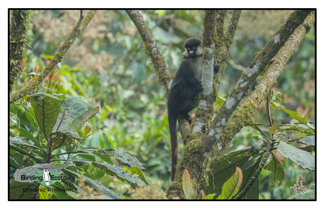
Red-tailed Monkey, one of the many primate species seen on this tour.

managing to get brief views of this skulker. After another excellent day of forest birding, we headed back to our lodge and looked forward to the exciting prospect of tomorrow's gorilla trekking!