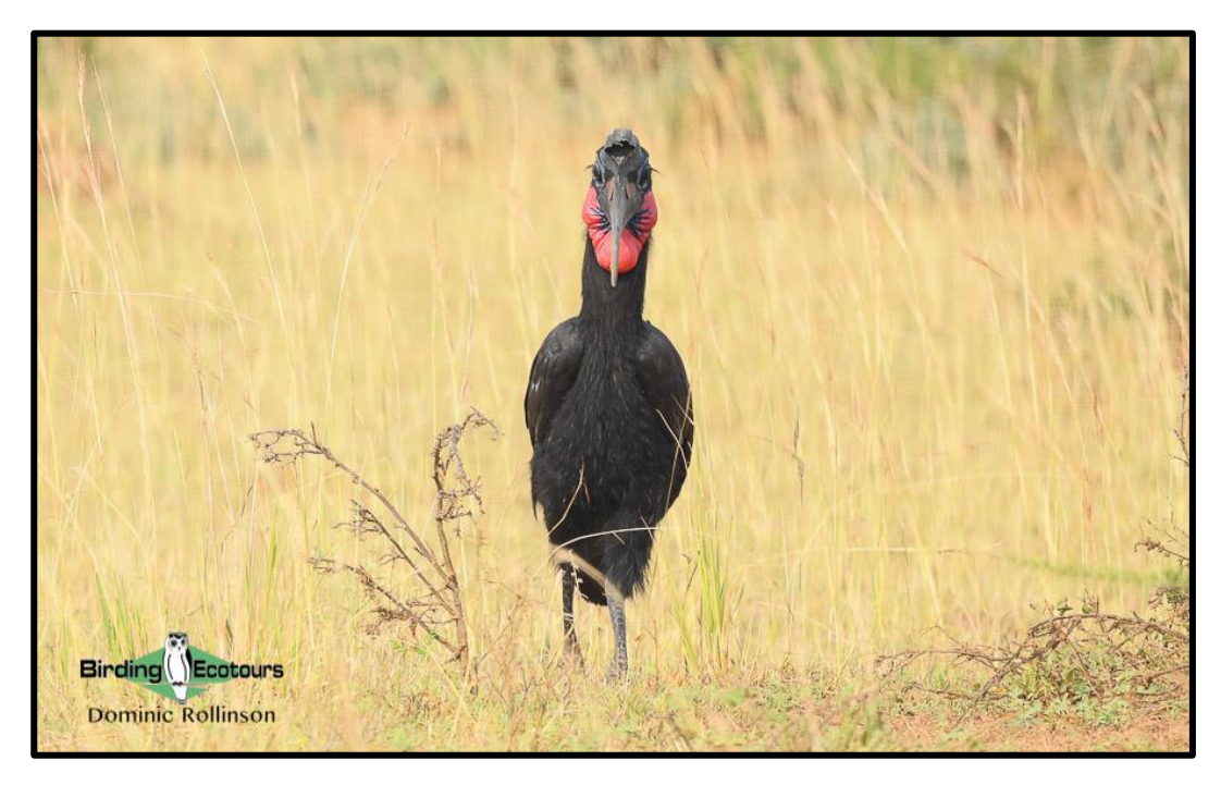
The huge Abyssinian Ground Hornbill in Murchison Falls National Park.

On the birding front, we had some great birds which kept us ticking over throughout the morning and early afternoon. Some of the highlights included Black-bellied Bustard, Black-billed Wood Dove, Senegal Thick-knee, Black-headed Lapwing, Rüppell's, White-backed and Lappet-faced Vultures, Bateleur, Dark Chanting Goshawk, Grey Kestrel, Red-necked Falcon, Abyssinian Ground Hornbill, Northern Carmine Bee-eater, Black-crowned Tchagra, Rattling Cisticola, Spotted Mourning Thrush, Red-winged Grey Warbler, Silverbird, Shelley's Sparrow, White-browed Sparrow-Weaver and Speckle-fronted and Vitelline Masked Weavers. After lunch, on our way back to our lodge, we stopped at a small waterhole where Frances did well to spot a single Greater Painted-snipe.