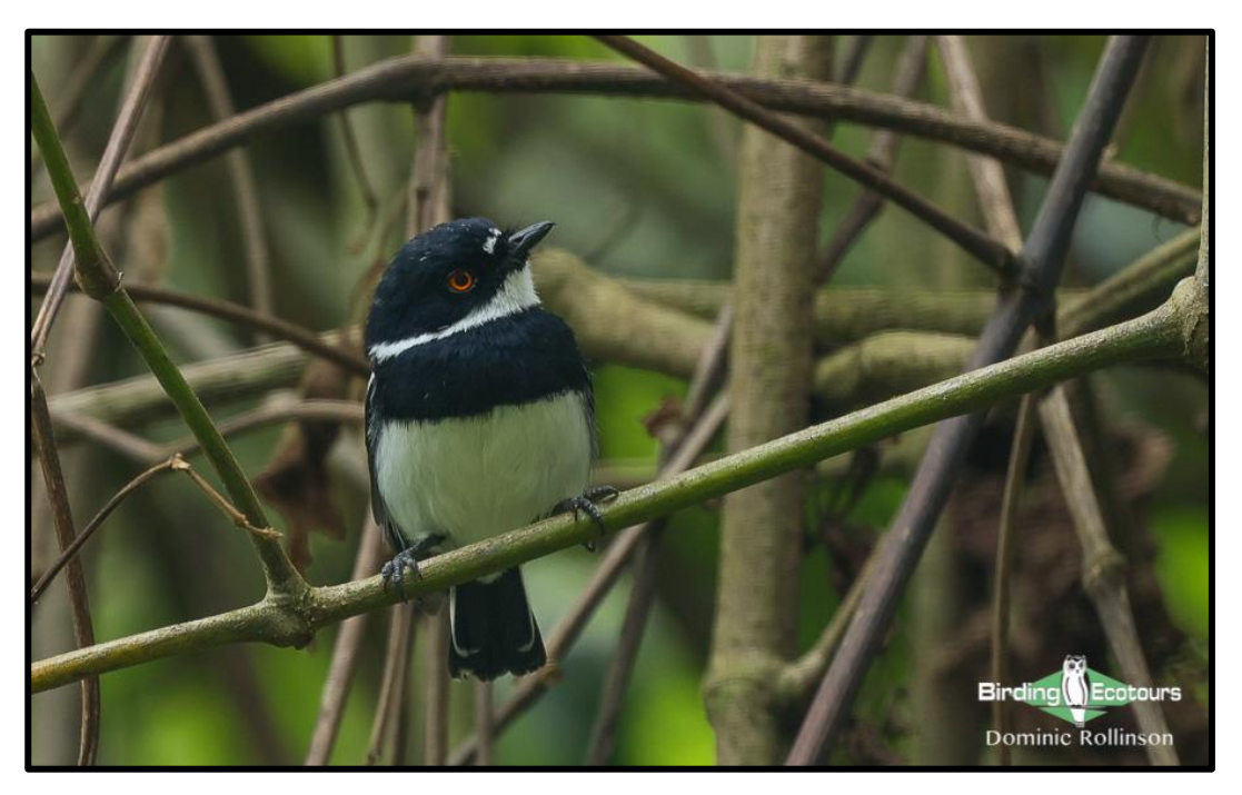
Rwenzori Batis was one of the many Albertine Rift endemics we saw on the Mubwindi Swamp hike.