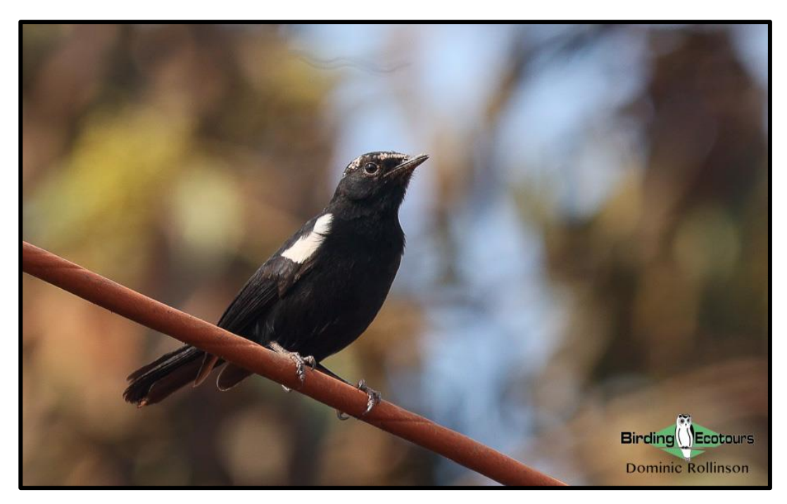
Ruaha Chat was incredibly confiding!

Along the drive we stopped for good looks at Grey Crowned Crane, Yellow-billed and Woolly-necked Storks and Pink-backed Pelican. A stop at a papyrus swamp gave us Swamp Flycatcher, African Stonechat, Greater Swamp Warbler, Carruther's Cisticola, Western Citril, Slender-billed Weaver and an African Yellow Warbler which we tried to turn into Papyrus Yellow Warbler but had to settle with its commoner cousin. The calling White-winged Swamp Warblers would unfortunately not show themselves. The increase in elevation meant that we started seeing birds such as Bronzy Sunbird, Augur Buzzard, Cinnamon-chested Bee-eater and our main target for the drive, Ruaha Chat. After a long drive we made it into Ruhija just as the sun was setting and looked forward to the prospect of tomorrow's Mubwindi Swamp hike.