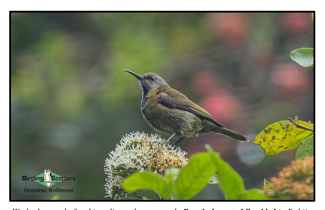
We had to settle for this eclipse plumage male Purple-breasted Sunbird in Ruhija.

For those who were keen, we had a predawn start for Montane (Rwenzori) Nightjar which eventually showed for us after some work. The rest of the morning was spent birding the forest edge looking for a number of montane forest specials and we were again successful in locating most of our targets. A flowering tree had good numbers of sunbirds present including our desired Purple-breasted Sunbird along with Green-headed, Collared, Bronzy and Regal Sunbirds. Further down the track, some managed to see Mountain Yellow Warbler which proved very difficult to locate. Other good birds included Western Tinkerbird, Slender-billed, Sharpe's and Violet-backed Starlings, Thick-billed Seedeater and a calling Doherty's Bushshrike which would not reveal itself! Along the 'School Track' we had good views of Fine-banded Woodpecker and a relatively showy pair of Grauer's Warblers.