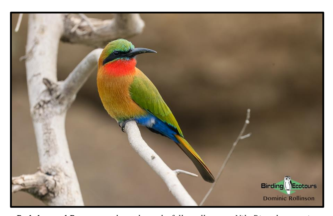
Red-throated Bee-eaters showed wonderfully well on our Nile River boat cruise.

After breakfast we jumped in the bus and drove to the Nile River, en route we managed new birds in the form of Singing Cisticola and Red-winged Prinia (Warbler), which were nice to finally catch-up on. Our Nile cruise was a thoroughly enjoyable and relaxing few hours along the mighty river which culminated in spectacular views of the majestic and powerful Murchison Falls. As usual, the birding was great and we saw Saddle-billed Stork, African Darter, Intermediate Egret, White-backed Night Heron, African Skimmer, Rock Pratincole, Red-throated Beeeater, another White-crested Turaco and had good views of a lovely Giant Kingfisher. On our way back to the lodge for lunch we had our only Black-winged Red Bishop of the trip.