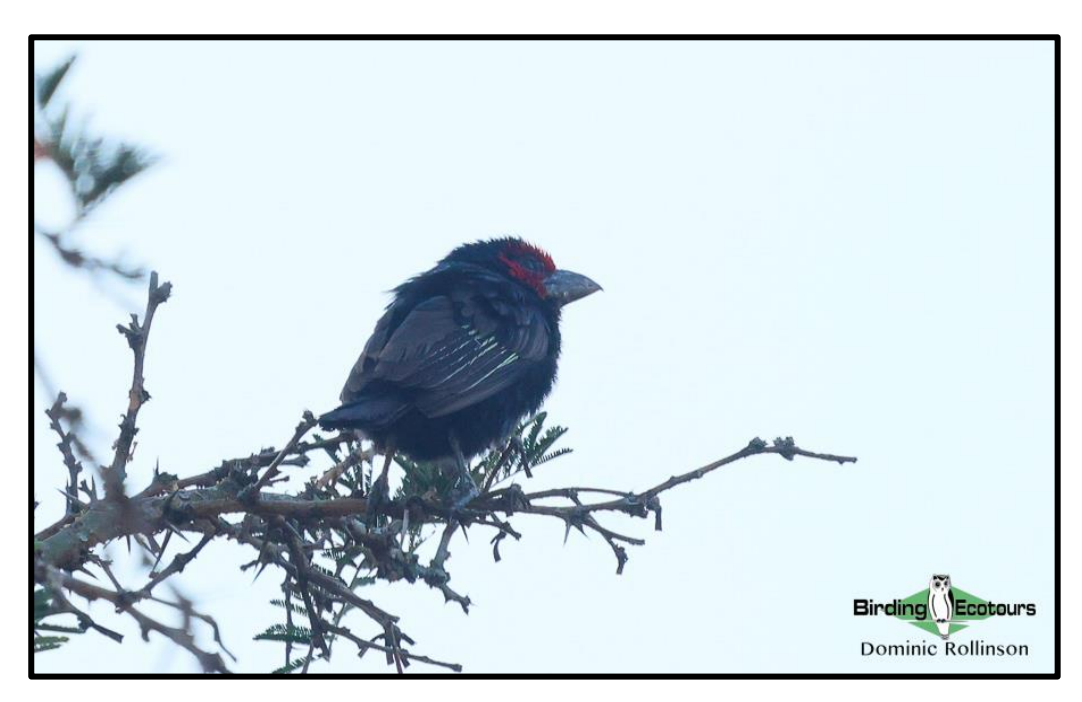
Red-faced Barbet took some finding at Lake Mburo National Park.

As we were still missing our primary target of the area, Red-faced Barbet, we decided to head back into the park to bird the woodlands around the entrance gate. It did not take long before we had a pair of Red-faced Barbets with a Black-collared Barbet in tow and we enjoyed prolonged looks of these two similar barbets, both with very restricted ranges in Uganda. This morning proved particularly birdy and we also added Common Scimitarbill, Green Wood Hoopoe, Grey-headed Kingfisher, Southern Black Flycatcher, Black-bellied Bustard, African Grey Hornbill, Fawn-breasted Waxbill and Gabar Goshawk. After a late breakfast, we then hit the long road to Ruhija.