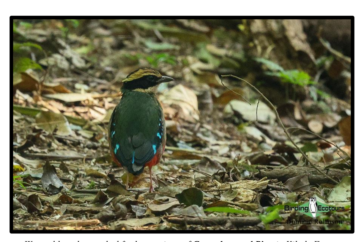
We could not have asked for better views of Green-breasted Pitta in Kibale Forest.