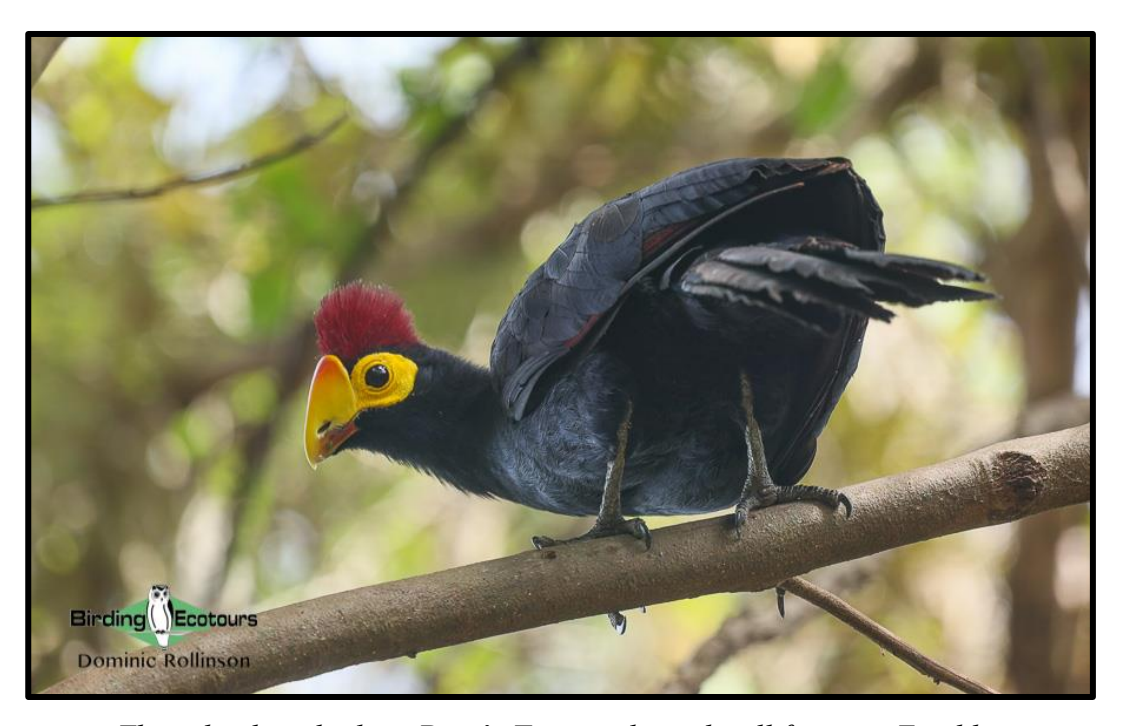
The ridiculous-looking Ross's Turaco showed well for us in Entebbe.

With the entire group having arrived at least the day before, we were able to get up early and begin exploring the leafy garden of our hotel and the surrounding area. It didn't take long until we had built up a decent list of the common birds of Entebbe which included the likes of Palm-nut Vulture, African Goshawk, African Hobby, Grey Parrot, African Grey Woodpecker, Double-toothed Barbet, Ross's Turaco, Eastern Plantain-eater, Jacobin Cuckoo, African Green Pigeon, Black-headed Gonolek and Red-chested, Scarlet-chested, Green-headed and Variable Sunbirds.