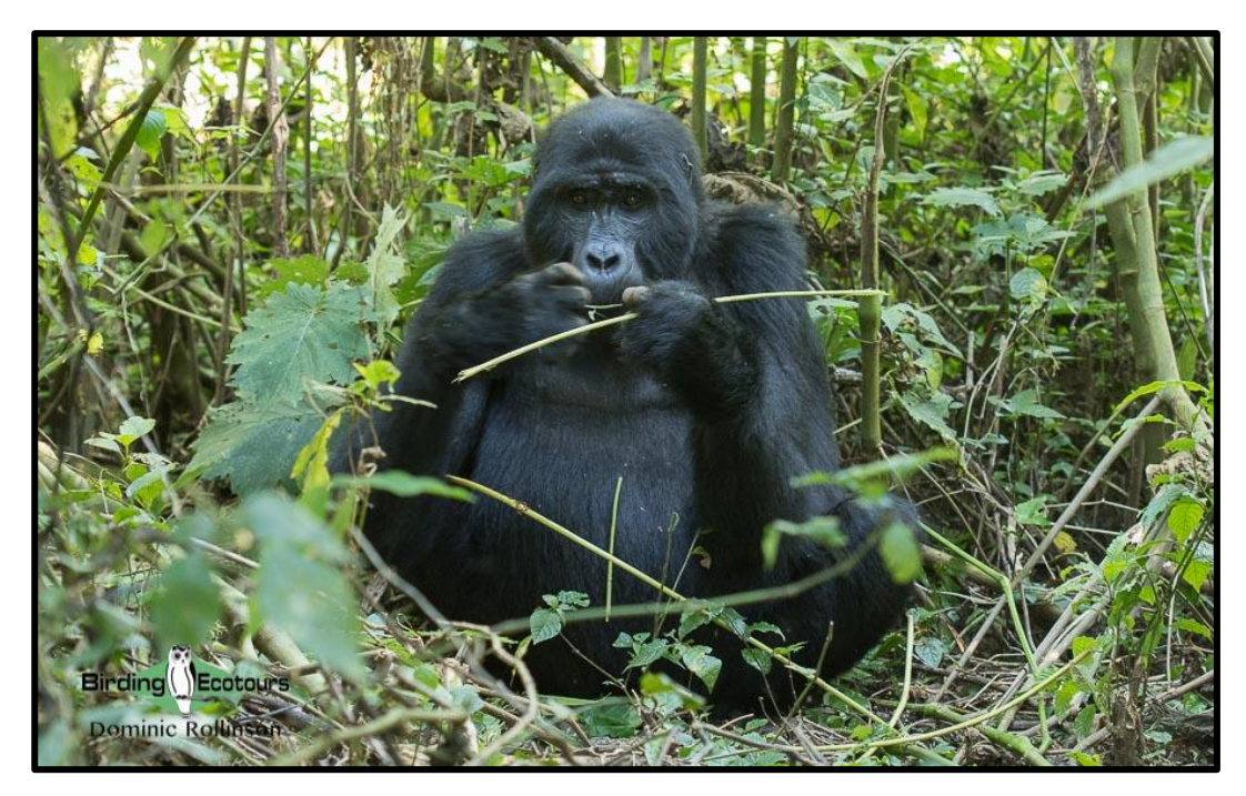
Eastern (Mountain) Gorilla trekking was one of the many highlights of this tour.

This customized 17-day version of our set-departure Uganda tour took in most of the classic Ugandan birding and wildlife sites, however we did not visit Semliki Forest or Mgahinga Gorilla Reserve, in the southwest. We were able to target (and find) many of the Albertine Rift bird endemics and then of course sought out a host of charismatic and iconic Ugandan birds such as Shoebill , Green-breasted Pitta and Grauer's Broadbill and then enjoyed ourselves as we focused on other classic Ugandan wildlife such as Eastern (Mountain) Gorilla , Chimpanzee , various other primates and many more.