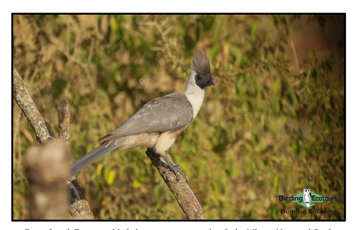
Bare-faced Go-away-birds kept us entertained at Lake Mburo National Park.

Today we had the full day to explore the Lake Mburo area and to track down as many of our targets as possible. As we left our lodge at sunrise, we found our first Trilling Cisticola, Bare-faced Go-away-bird, Bateleur, Brown-backed Scrub Robin, Orange-breasted Bushshrike and our only White-headed Barbet of the trip. At the Lake Mburo National Park entrance gate, we enjoyed a good bird party which held the likes of Grey Penduline Tit, Striped and Woodland Kingfishers, Buff-bellied Warbler, Grey-backed Camaroptera and Black-lored Babbler. Overhead we had Mosque and Red-rumped Swallows and a single Brown-throated Martin. Once we made it into the park, we soon found the localized Long-tailed Cisticola while the large herds of African Buffalo were adorned with Yellow-billed Oxpeckers. We enjoyed our first looks at other large game here including the likes of Plains Zebra, Impala, (Defassa) Waterbuck, (Rothschild's) Giraffe and large troops of Olive Baboon and Vervet Monkey.