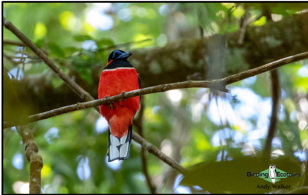
Red-naped Trogon gave us some close views while birding in Kubah National Park.

Maroon Woodpecker, Asian Fairy-bluebird, and Chestnut-naped Forktail to name just a few of the goodies. Alas, no sight or sound of Rail-babbler or Crested Jayshrike here today though.