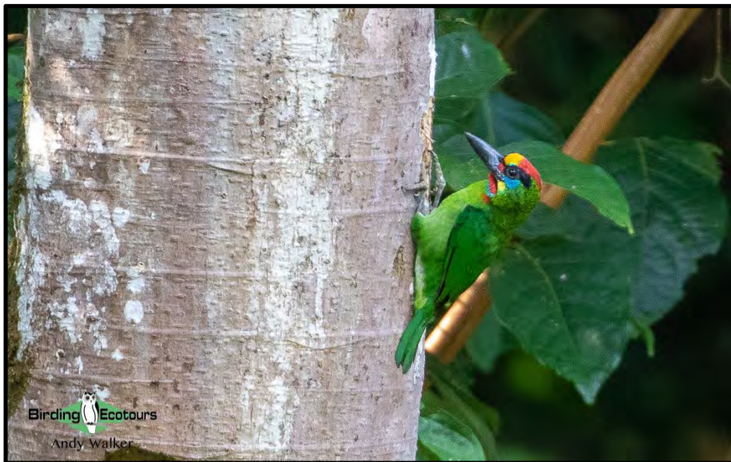
This Red-throated Barbet was busy excavating holes and unconcerned by our presence.

Heading out along a mountain trail along the Malaysia-Indonesia border we were able to add birds to lists for both countries, which was great fun! We found Red-throated Barbet nest building and had Mountain Serpent Eagle , Scaly-breasted Bulbul , Olive-winged Bulbul , White-bellied Erpornis , Chestnut-crested Yuhina , White-rumped Shama , Black-and-yellow Broadbill , Checker-throated Woodpecker , Golden-whiskered (Golden-faced) Barbet , and Bornean Barbet on one side or another of the border, or occasionally on both sides! Inside the forest we watched Eye-browed (Whitehead's) Wren-Babbler at close range crisscrossing the border at will, and right at the end of our walk we saw a pair of Crested Jayshrikes again, and this time they were in Indonesia! A great end to our morning birding session.