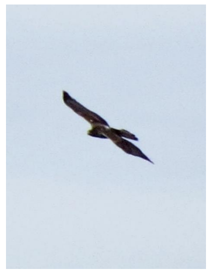
Bonelli's eagle