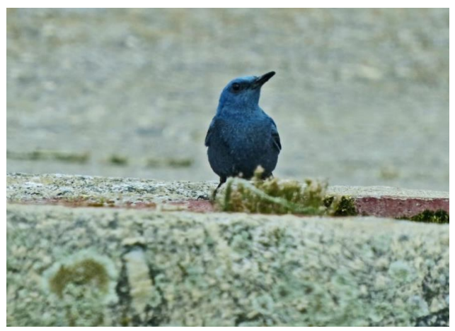
Blue rockthrush

We headed next to our destination at Hotel Porta Coeli near San Martin del Castañar, where we dined on the terrace with wonderful views of the Sierra and Red-rumped swallows, which nest under the eaves.