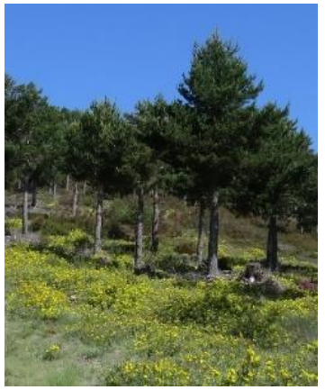
Halimium lasianthum ssp. Alyssoides

After briefly entering Extremadura to skirt around the south of the Sierra de Francia, we headed to some granite picnic tables in a pine forest by the Alagon river, where we restored our energy levels before walking along the river edge. Here we saw many Coal tits, Golden oriole, Turtle dove, White wagtail and Cirl bunting.