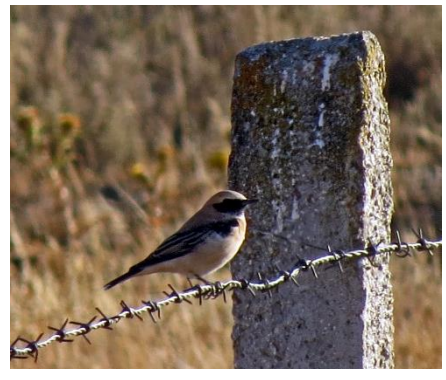
Black-eared wheater

After a picnic lunch by the river where we saw Golden oriole, we drove to an area of mixed farmland and open woodland, and as hoped for we found Iberian grey shrike, Iberian magpie, Griffon vulture and Ocelated lizard Timon lepidus . Here also were good numbers of Corn bunting and Woodchat shrike.