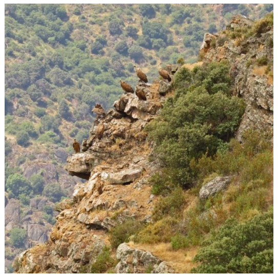
Griffon vulture colony

From here we headed to a viewpoint overlooking the confluence of the Camaces and Huebra rivers. We stopped on a bridge over the Camaces to watch White and Grey wagtail, Crag martin and Red-rumped swallow, and a very strange white creature, the Myrmecophilous silverfish Proatelurina pseudolepisma which D spotted and which parasitizes ants. On reaching the viewpoint we were in luck: no sooner had we got out of the van than we saw a pair of Egyptian vulture. There were plenty of Griffon vulture too, as they have large colonies around here. But the stars of the morning were the pair of Bonelli's eagle that appeared and stayed for some time, giving us great views. We also saw Blue rockthrush on a ledge over a waterfall, and Dartford and Sardinian warblers here.