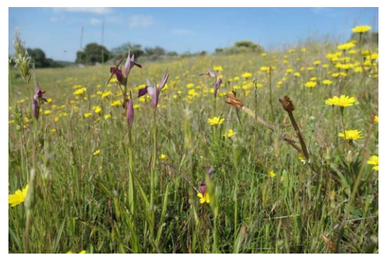
Tongue orchid Serapias lingua

On reaching a hillside overlooking the river, we set up the scopes in case the Black stork should reappear. Whilst D and I headed to check out the old mill, supposedly open to the public but actually locked, Alfonso and D were lucky enough to see the Black stork wandering into view in the valley below.