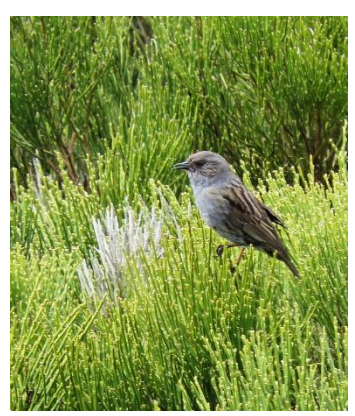
Dunnock Photos BISWW

We drove on to the lovely mountain village of Candelario, through its narrow streets with water channels for the snow melt to run down. Here we stopped to discern a few Pallid swifts among the rest of the Swifts which nest in the village. We then drove to the woodland on the mountain side where we were able to see and hear the Iberian subspecies of Pied flycatcher, Western bonelli's warbler, Iberian chiffchaff, Whitethroat and other resident forest birds, before the weather began to cloud over and look rather menacing.