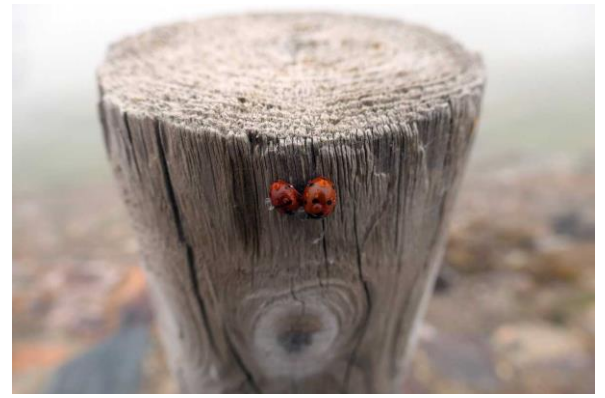
Ladybirds in the fog.

We woke to a sea of fog, which might have been local or far reaching. We decided to stick to our course and headed for the high peak of the Peña de Francia, 1727m above sea level, with its monastery and an underground chapel dedicated to a small wooden figure of the Virgin Mary found in a cave beneath. We hoped we might get clear skies overlooking an ocean of whiteness, having once experienced this marvel. In the event the fog was everywhere, and although very atmospheric it limited our birding capacities to muffled birdsong and lots of guesswork. We were however able to hear and see Crag martin, Rock bunting, Wheatear, Linnet, Raven and Black redstart, and further downhill amongst the trees and a sudden lifting of the mist we saw Western Bonelli's warbler, Coal tit and Robin, and heard Iberian pied flycatcher.