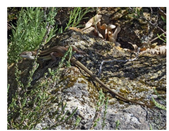
Algerian wall lizard

The afternoon was turning wet as we arrived at the medieval walled village of Miranda del Castañar, which we were able to visit after a short downpour and a much appreciated ice-cream, eaten as we sheltered in the van. Here in the narrow cobbled streets with half-timbered houses and balconies almost touching, Common Swift, Crag martin, Barn and Red-rumped swallow are all present alongside the resident Black redstart and House sparrows. On a good day the views from the village walls over the Sierra would most likely have given us Black and Egyptian vulture, but