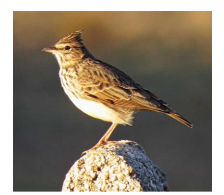
Thekla lark photo BISWW

Later we drove upstream of the river Tormes to the medieval village of Puente del Congosto. Despite our shock at finding that several trees had been chopped down near the river (possibly to make way for scaffolding as the medieval bridge is being restored), we had good sightings of both male and female Blue rockthrush, Crag martin, Serin, White wagtail, Nuthatch and the White stork family on the church tower.