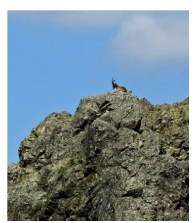
Spanish Ibex Capra pyrenaica ssp. victoriae