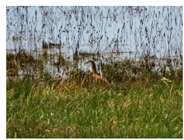
Squacco heron

After lunch we birded from the banks of the reservoir, watching Black-winged stilt, Whiskered tern, Black tern, Montagu's harrier (at last), Squacco heron, Black-tailed godwits, Great crested grebe, Little grebe, Black-headed gull, Little plover, Common sandpiper, Grey heron (with chicks) and Shoveler amongst others.