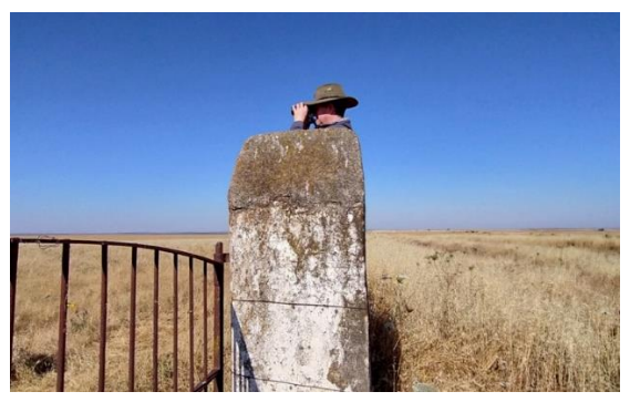
Looking out for Little bustard Photos BISWW

This should have been our last day, but D and D asked if we would be willing to go back up the mountain and try again for Bluethroat the following morning, so that's what we did.