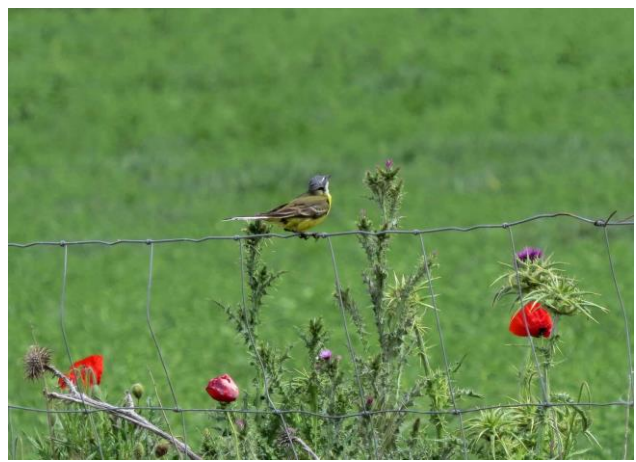
Iberian yellow wagtail

Montagu's harrier. We drove northeast, stopping to photograph a colony of storks on an old factory building, and from a ridge watched groups of male Great bustard just visible in the valley below, shimmering with heat haze as temperatures rose. The lekking season was over but some were still displaying a little. Here were Bee-eater, Iberian yellow wagtail, Stonechat, Spotless starling and Short-toed lark camouflaged against the brown earth, with Black Kite, Booted eagle and Marsh harrier above, and a Short-toed eagle resting on the ground by a pond. Lots of Griffon vultures present in the background. We tried in vain to find some Little bustard: seen occasionally in the area, but after several false alarms (ravens playing hide and seek and jumping up and down behind long grass as if they knew what we'd come for and were having a laugh at our expense!) we decided it was time for some lunch in the shade. We drove to the small reservoir of Azud de Riolobos, stopping to watch Lesser kestrel around an abandoned church tower taken over by Jackdaws, and set up our picnic in a pine plantation.