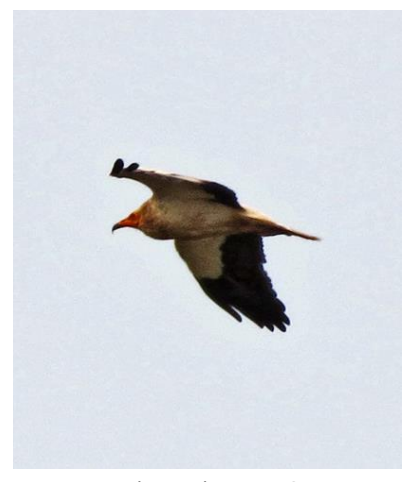
Egyptian vulture

On the way back to the hotel we stopped at a pre-Roman Castro. This iron-age hillfort with its field of deterrent vertical pointy stones to ward off invading marauders on horseback is the work of the Veton people, who populated the area for several thousand years and were responsible for the granite carvings of large boars and bulls scattered around Salamanca, Avila and Zamora, as well as parts of Portugal. My ancestors! Here we saw Booted eagle and Dartford warbler as well as Brown argus and Small skipper Thymelicus sylvestris . Stopping at a bridge over the Huebra we saw European pond turtle.