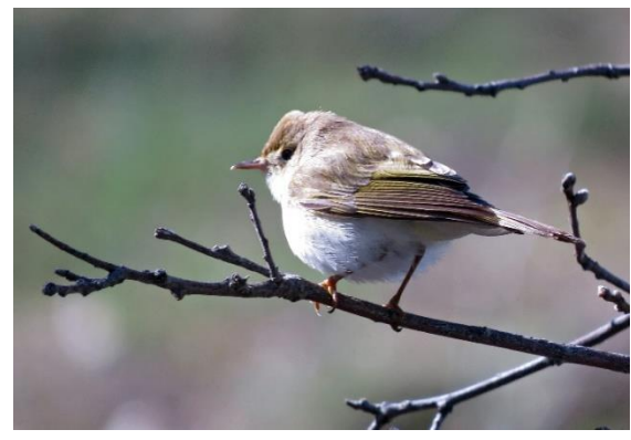
Western bonelli's warbler

We drove down the other side of the Peña, out of the fog and past mountainsides of scree, to the fossil rich village of Monsagro. On arrival we saw a pair of Egyptian vulture. Here the houses are built with local stone covered in the fossilized tracks of Trilobites, known as Crucianas, from the Cambrian period. This has been made into a small tourist attraction, with a fossil trail and a visitor centre dedicated to ancient seas, as all this area was once under water. The village also has some interesting circular terracing which served for growing crops and as a threshing area after harvesting. Here we saw Black kite, Griffon vulture, White wagtail, Serin, Black redstart, Red-rumped swallow, Barn swallow and House martin.