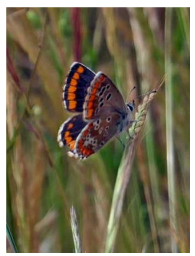
Brown argus Aricia agestis cramera

We retired back to the hotel for our last night here and another lovely meal in the gardens.