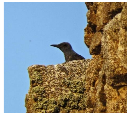
Female Blue rockthrush photo BISWW