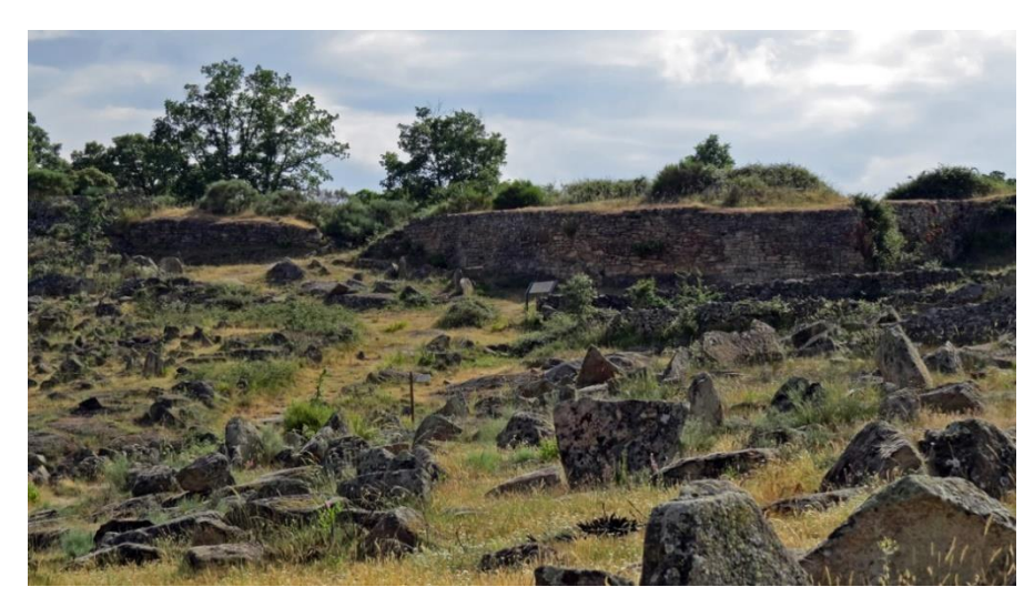
Saldeana castro Photo BISWW