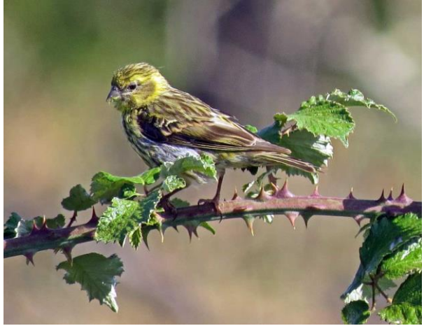
Serin Photo BISWW

We began by visiting the outlying area of the village, walking along tracks by allotments and fruit orchards. Nightingale, Collared and Turtle doves, Serin, Hawfinch, Greenfinch, Blackcap, Sardinian and Melodious warblers, Spotless starling, Corn and Cirl buntings, Woodchat shrike, Iberian magpie, Black and Red kite gave for an entertaining mornings' observations.