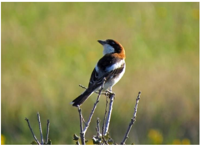
Woodchat shrike

From here we headed to a viewpoint overlooking the confluence of the Camaces and Huebra rivers. We stopped on a bridge over the Camaces to watch White and Grey wagtail, Crag martin and Red-rumped swallow, and a very strange white creature, the Myrmecophilous silverfish Proatelurina pseudolepisma which D spotted and which parasitizes ants. On reaching the viewpoint we were in luck: no sooner had we got out of the van than we saw a pair of Egyptian vulture. There were plenty of Griffon vulture too, as they have large colonies around here. But the stars of the morning were the pair of Bonelli's eagle that appeared and stayed for some time, giving us great views. We also saw Blue rockthrush on a ledge over a waterfall, and Dartford and Sardinian warblers here.