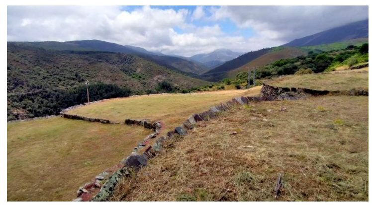
'Eras': circular threshing grounds of Monsagro