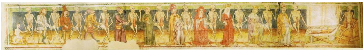
Hrastovlje's 15 th Century danza macabra

There is ornithological content too in the murals and they appear to show a bird that could represent a young Bald Ibis which of course would be ridiculous were it not for the fact that the painter (John of Castua) was born and brought up in Istria and the species is specifically mentioned for Istria by two 15 th Century naturalists, the Austrian Gesner (1557) and the Italian Aldrovandi (1603). Proof of the bird's presence in Europe came when their remains were found in the medieval middens of Salzburg in the northern Alps. 500 years ago the area was very different, there being very few forested areas and vast heavily-grazed grasslands dominated the landscape – ideal habitat for the ibises.