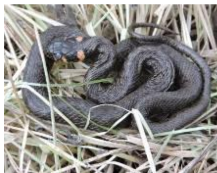
Left: Slow-worm Anguis fragilis out and about after the rain. Right: Grass Snake Natrix natrix

Strikingly, its collar appeared orange rather than the usual yellow-buff. A short walk to the polje 's swallow-hole, where the water drains away into the karst before re-emerging about 5km away (and about 20°C hotter) behind our hotel, revealed a few Summer Snowflakes still in flower, relatives of the snowdrop,. But by now it was getting on and time to return to the hotel.