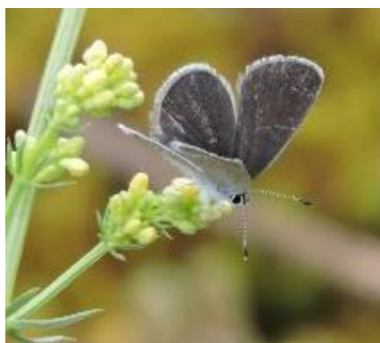
Small Blue Cupido minimus