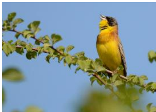
Left: Tawny Pipit Anthus campestris . Right: Black-headed Bunting Emberiza melanocephala by Claudia Grandi, but the same male we saw, photographed the same day.

An obliging Tawny Pipit sat out for us on a handrail overlooking the sea where a Mediterranean Shag flew past. Brief views were had of a Short-toed Eagle hunting over the scrubland and drifting north, whilst all the swifts seen were Pallid Swifts which nest in several sea caves along the coastline. After lunch, as we set off to make our way towards Pula to see the Roman Arena, we stopped to look at a rather splendid Pink Butterfly Orchid beside the road. It soon became clear we'd been looking in the wrong place for the orchids this year, and here, on better soils and flat ground, they had fared much better, with thousands of Tongue Orchids together with Bertoloni's and tiny Bumblebee (Bee) Orchids as well as those we'd seen earlier this morning.