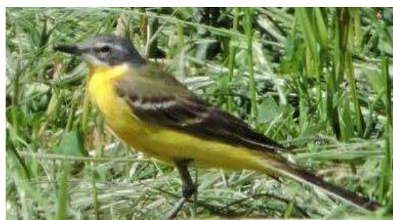
Left: Grey-headed Wagtail thunbergi . Right: Blue-headed Wagtail Motacilla flava flava .

The meadows further on were host, once again, to what seem to be three of the commonest birds in Istria, Corn Buntings, Red-backed Shrikes and Melodious Warblers, while the plants included Bog, Monkey and Lady Orchids together with a spectacular plant of the rather rare, here at least, Siberian Iris.