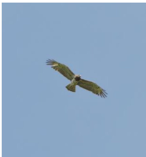
Short-toed Eagle Circaetus gallicus

As we descended the gravel road that crosses the hillside we came across large numbers of ringlet butterflies. Checking the photographs and relevant documentation it would appear that these were Woodland Ringlets rather than the near-identical Bright-eyed Ringlet which emerges almost a month later. There were plants too, including the speciosa subspecies of the Early Purple Orchid, a Frog Orchid, hundreds of Star-of-Bethlehem and wonderfully perfumed Burnet Roses, while Paul 'tickled' a Two-spotted Field Cricket out of its burrow with a blade of grass. Moving down through the extensive grasslands we were rarely out of earshot of Ortolan Buntings although they remained stubbornly out of sight. There were very few birds of prey visible apart from a pair of Kestrels, a single Common Buzzard and a Peregrine which dashed through. Returning back up the road for lunch we were treated to a singing Lesser Whitethroat though he remained hidden in the Mugo Pine.