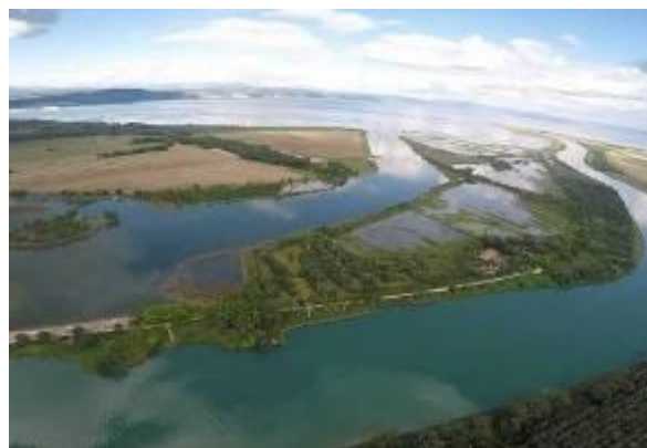
Isola della Cona, Photo: Jèan Francois Pegàn

Some of the interesting species seen here included Squacco Heron, Cattle, Little and Great White Egret, Purple Heron, a dozen or so Spoonbills, Pygmy Cormorant, Mute Swan, Greylag Goose, Shelduck, Shoveler and Pochard, Moorhen, Coot, a distant Gull-billed Tern, Black-winged Stilt Little Ringed Plover, Lapwing, Wood Sandpiper, and breeding Bee-eaters.