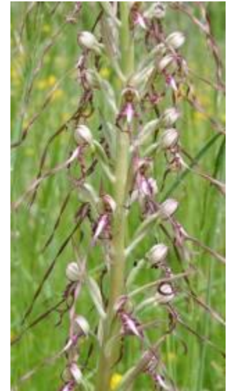
Right: Adriatic Lizard Orchid Himantoglossum adriaticum

We went to dinner at the nearby Dolina restaurant at about 7.00 p.m. Temperatures had dropped off a bit and when we emerged into a beautiful evening we could hear at least two Nightjars churring from behind the hotel. From our rooms we could hear Scops Owls calling nearby although thankfully the Raven had calmed down compared to the previous night!