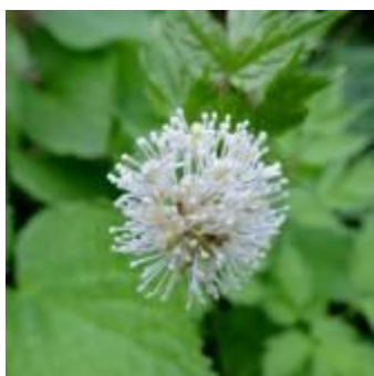
Baneberry flower (detail) Actaea spicata

As we approached the mountains we left the highway and went onto the 'old' road which goes over a pass at about 1000m, stopping briefly at the roadside fountain commissioned by the Hapsburg Emperor Joseph II where a beautiful Chequered Skipper was spotted. So rare in the UK, this species is common in these cool but sunny beechwoods. A nearby lane gave a sample of the woodland flora to be found at these sites, including Angelica, Greater Meadow-rue, Baneberry and Fly Honeysuckle as well as the very large and imposing columnae subspecies of the Cowslip. There were interesting trees too including the Italian Acer opalus subspecies obtusatum and Norway Maples Acer platanoides .