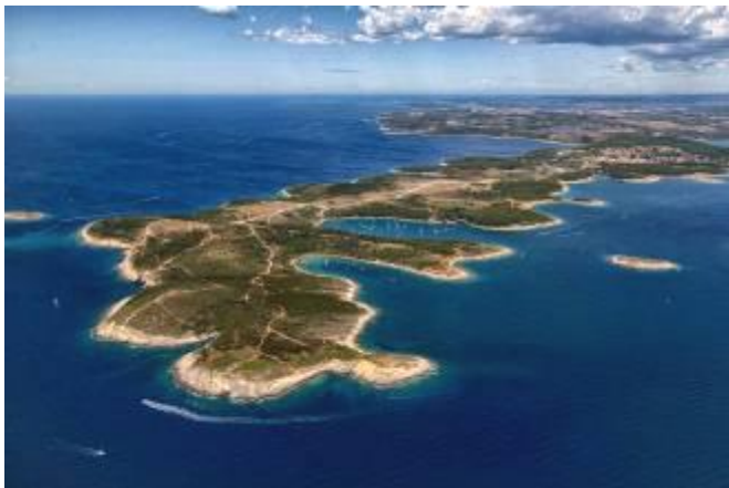
Pta. Premantura, the southernmost tip of Istria with a unique microclimate.

The journey south was uneventful and we were soon at our destination and when we arrived we almost had the place to ourselves. Crowds would surely begin to arrive later as the weekenders from Germany and Austria and the locals got off work. Premantura is famous for its many orchid species and we soon noticed one of the scarcer species, Man Orchid, although the plant was in poor condition. The south-facing parts of