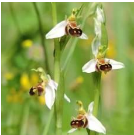
The Crazy Golf Bee Orchids Ophrys apifera

By virtue of the late flight back to London we still had almost a full day's birding and botanizing to enjoy, and after taking some final photographs of the orchids on the crazy golf course and paying the bill we set off for an upland visit to an area about 15km east of the hotel to the interior part of Istria with mountains, part of the Dinaric Alps running NW–SE and parallel with the eastern Adriatic coastline.