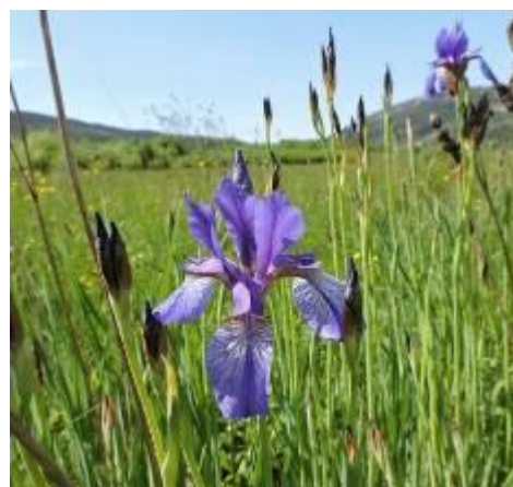
Siberian Iris Iris sibirica

After dinner a few intrepid souls set out along the river once again but there was no sign of any of the Nightjars resting on the gravel in the headlights or of the hoped-for owls. The big reward came on the drive back through the forest close to the hotel, on just side-lights (there was a bright full moon), there being literally thousands of fireflies, probably Luciola italica , along the route, a fantastic wildlife spectacle