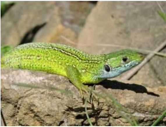
Green Lizard Lacerta viridis

Another Karst venue was on the programme today, a little further away and a little higher up after yesterday's local walks, kicking off the day with a stop at a beautiful meadow close to the road at the village of Butari. The flysch-based soils over sandstone have excellent water retention and few have escaped the plough even though much of this marginal area is now abandoned to scrub. As we got out of the minibus to continue on foot, a nice, if not fully-grown, male Green Lizard was spotted sunning itself on a roadside rock, seemingly oblivious to the cameras pointed in its direction. Later in the day with a couple of hours of sun he would surely have been more skittish.