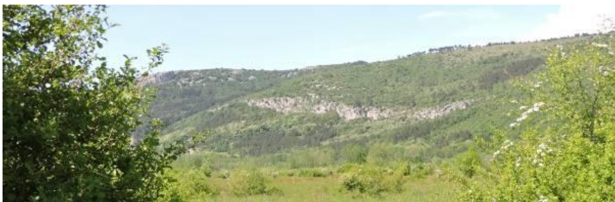
The view up to landa carsica from the agricultural area in the polje below

We parked and walked down through the grassland. Eastern Fritillary flowers had already gone over and the seed-heads were forming but the air was filled with the scent of Thyme as well as Winter and Lilac-flowered Savory. It was hot and birds were few and far between but we soon heard the first distinctive song of Ortolan Bunting, now extremely rare in Slovenia, with Rakitovec one of the last sites. It seems to require this dry karstic grassland for breeding but with nearby access to richer agricultural areas where the females search for insect food for the chicks, perhaps explaining the attractiveness of this site as the small cultivated fields close to Movraž are clearly visible, maybe a ten minute flight away. Although we heard several birds singing they are rather shy and only one was kind enough to provide a decent telescope view.