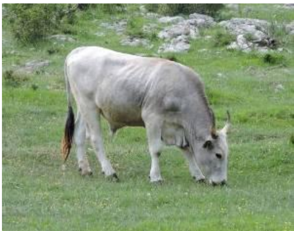
A young Boskarin bull

We awoke once again to warm sunshine and light mist, suggesting yet another hot and sunny day. A quick walk from the hotel up to the quarry revealed a Rock Bunting and excellent views of Alpine Swifts entering and leaving the colony in the cave.