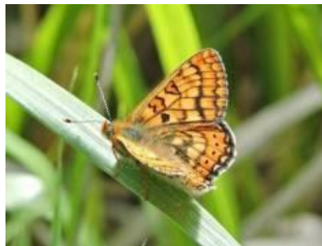
Marsh Fritillary ( Euphydryas aurinia )

The only rain of the week took us a little by surprise, but refreshed the puddles while we went for a coffee in Portole after lunch, finding, by coincidence, the perfect spot for the following Tuesday's evening meal when our regular restaurant is closed.