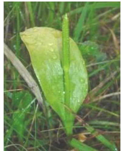
From the left: Bog Orchid Orchis palustris , Long-lipped Serapias Serapias vomeracea and Adderstongue Fern Ophioglossum vulgare

Rakitovec, our main stop, is a mid-altitude (c. 700m) area of open dry karst grassland, a habitat called ' landa carsica ' in Italian and ' gmajna ' in Slovene. It is under threat everywhere as a result of scrub invasion and vegetational succession as the marginal areas in which it is found have been abandoned and depopulated. Rakitovec was recently identified by the Slovene BirdLife partner DOPPS as one of the most important remaining areas of this habitat, holding most of the typical ornithological components. On our way up to the site we stopped at the local railway halt to admire a magnificent stand of Perfoliate Alexanders, a plant that created havoc when introduced to Kew Gardens but here, in its natural habitat, restricted to small patches close to the woodland edge. Examining the plants, Paul spotted a newly-emerged Tau Emperor Moth, a species typical of cool beechwoods in south-east Europe. Returning to the minibus we noticed at least half-a-dozen Scarce Swallowtails feeding on the flowering Lilac outside the station.