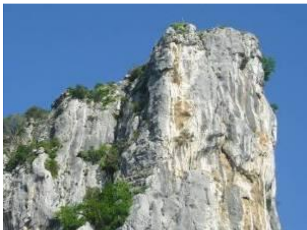
The rock above the Hotel – Istarke Toplice

The location of the Istarke Toplice hotel is superb for local walks that require only very short transfers in the minibus and we try to alternate these days with trips further afield.