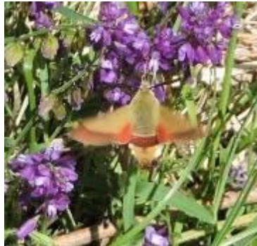
Above: Broad-bordered Bee Hawk-moth Hemaris fuciformis

The weather was very hot as we made our way up into the quarry above the hotel with Glanville Fritillaries skittering ahead of us over the gravel track. The Alpine Swifts performed splendidly, swooping in and out of the caves over our heads and entering their nest-holes in the roof, and there were some 'gone-over' Early Spider Orchids between the rocks. We were also amused and fascinated by a Broad-bordered Bee Hawk-moth flitting like a hummingbird around the milkwort. Coming down to return to the hotel we passed the hotel's crazy golf course, still uncut. Someone spotted a single Adriatic Lizard Orchid (shades of the Sandwich Bay golf-links?) and soon we were seeing dozens together with a pair of Monkey Orchids and a single Bee Orchid, all within 50 metres of the hotel's front door.