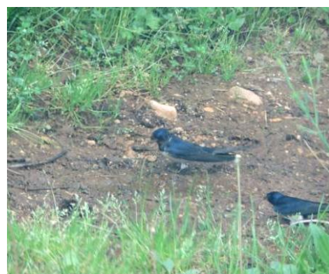
Barn Swallows Hirundo rustica collecting mud at Čepić

After lunch we headed towards the village of Čepić, a little to the east. The toponym "Čepić" is quite common in Istria and seems to derive from the Croatian noun for a spill and is always associated with a polje which floods (or flooded) regularly. Polje are large flat, fertile areas produced by