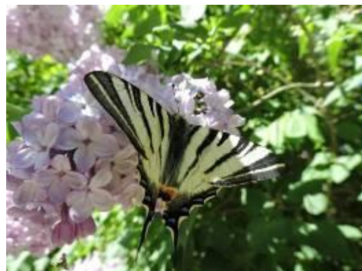
A newly-emerged Tau Emperor Moth Aglia tau on Perfoliate Alexanders Smyrniium perfoliatum and one of half-a-dozen Scarce Swallowtails Iphiclidides podalirius on Lilac Syringa vulgaris