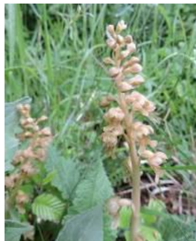
Bird's-nest Orchid Neottia nidus-avis

The next stop, near the country church of Our Lady of the Snows, produced some excellent birds, butterflies and plants as usual including great views of Turtle Dove, Whinchat, Cirl Bunting and splendid views of a singing male Cuckoo, Small Blue Butterflies and Grizzled Skippers. We also added a new species of orchid for the trip, the saprophytic Bird's-nest Orchid.