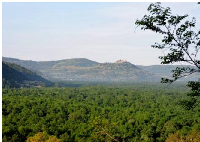
The view from the rock towards Montona-Motovun

After a long day yesterday a change of pace was in order, with local visits planned for today. Starting off with a walk to the top of the rock behind the hotel we were rewarded with excellent views of Subalpine Warbler and one of the (real) Rock Doves nesting in the crevices on the rock-face as well as close-up views of the endemic sandwort Moehringia tommasinii .