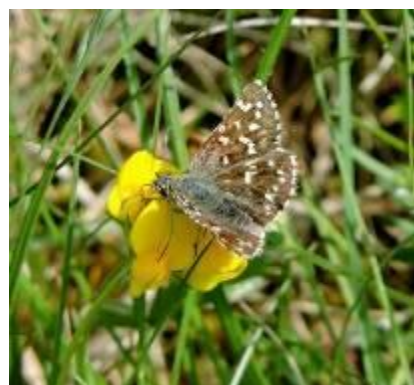
Grizzled Skipper Pyrgus malvae

A Cuckoo called close by while we ate and both Chiffchaff and Mistle Thrush were nesting nearby but the stars of the lunch-stop were several White Helleborine plants – we had seen flowering Sword-leaved Helleborine earlier in the week with its pure white flowers, but these were clearly a creamy colour with fewer, much broader, leaves. A very pleasant circular walk ensued as far as the unpronounceable village of Žnjidarići with beautiful meadows filled with orchids, Yellow Rattle, Carthusian Pink and Crested Cow-wheat although we failed to find the Lesser Honeywort we had come across in 2013. Here and there a Golden Oriole, Woodlark or Hoopoe passed through but we were now in the slow part of the day bird-wise between lunch and late afternoon. Butterflies were plentiful but very lively, Glanville Fritillaries, Small Blues and Grizzled Skippers particularly common, and the only Mazarine Blue of the week showed briefly.