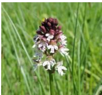
Burnt-tip Orchid Orchis ustulata

From here we were able to walk through the village itself, noting the village birds, Swallows, Black Redstarts and Pied Wagtails and the occasional calling Wryneck, before carrying on beyond the village to our lunch-stop amidst the pines further up the road. As we walked through the haymeadows and small-scale agriculture a pair of Ravens rose from a freshly-cut field ahead of us, probably the pair from behind the hotel which is not far from here.