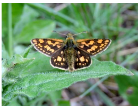
Chequered Skipper Carterocephalus palaemon