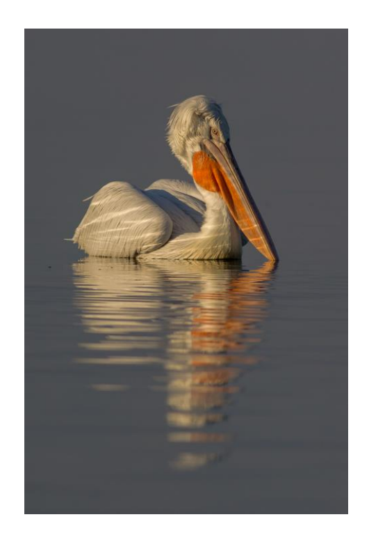
Dalmatian Pelican