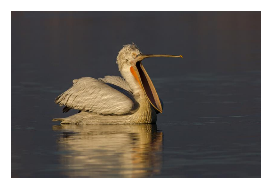
Dalmatian Pelican