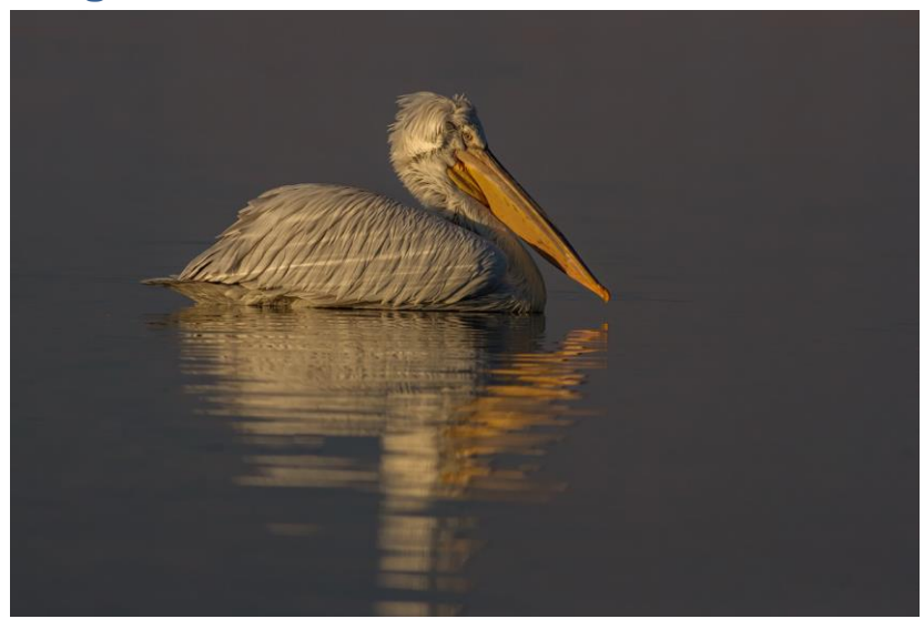
Dalmatian Pelican