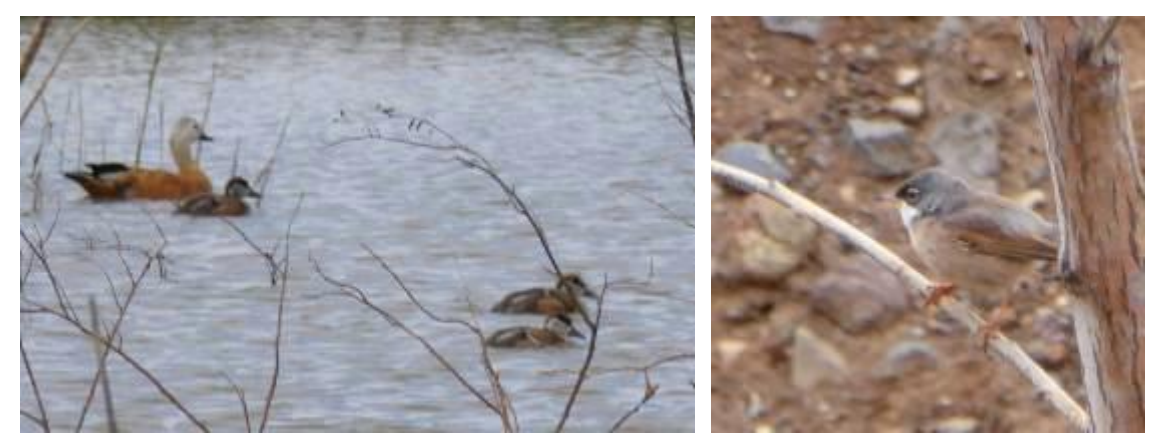
Ruddy shelduck with goslings ("like little humbugs"); and spectacled warbler (JR)

Rain clouds had been gathering while we watched the whales, but fortunately there was a handy café so we retreated first to the relative shelter on the veranda, then when things got really nasty to the interior! The toilets were well worth a visit here. The ladies' loo seat cover had a fetching picture of a goldfish on it and the equivalent picture in the gents had an impressive 3D image of a great white shark.