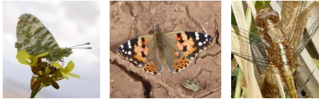
Green-striped white (HC); painted lady (DM); and epaulet skimmer – the diagnostic black-bordered white stripe (epaulet) on the side of the thorax is just visible (HC)