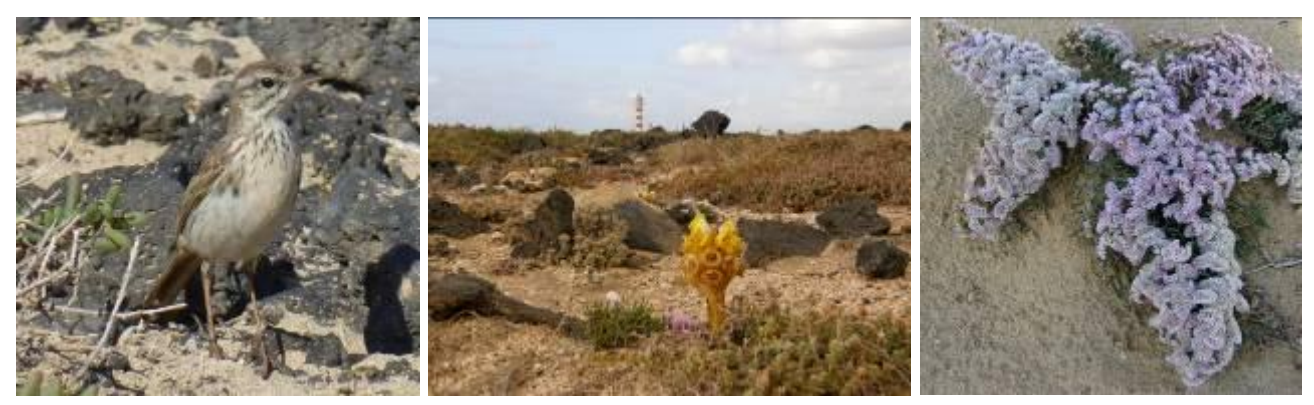
Berthelot's pipit (KD); Cisitanche phelypaea and Toston lighthouse (HC); Limonium papillatum (MC)

We ate our packed lunches in one of our villas before heading out for the afternoon to the coast at El Cotillo. We parked by the lovely sandy cove near the lighthouse at Toston where we saw a few whimbrels, turnstone and common sandpiper as well as a fearless Berthelot's pipit which ran around us. Then we had a short walk across the sand-covered lava leading to another cove. Here we enjoyed a range of coastal plants, the showiest of which were the yellow-flowered umbellifer Astydamia latifolia and lots of the lovely endemic sea lavender Limonium papillatum . We also noted the peculiar succulent shrub Zygophyllum fontanesii with its grape-like swollen stems, Sea Heath Frankenia capitata, the endemic Lotus lancerottensis and the somewhat similar looking yellow-flowered toadflax Kickxia sagitata .