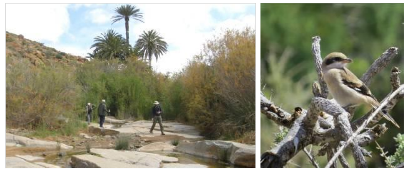
Rock-hopping at the start of the barranco walk; and juvenile southern grey shrike

This barranco is one of the few on the island that has a permanent trickle of water running down it. Due to the recent rain, there was now rather more than a trickle, which made the narrower first section more difficult than usual. Nevertheless, with a bit of care we all managed to make our way through to the wider, flat part of the barranco where a small pale yellow butterfly could be seen flitting through the sparse flowers. It was our first greenish black-tip of the week. There were painted ladies and clouded yellows too, and a large butterfly that flitted past just one of the group just might have been a plain tiger.