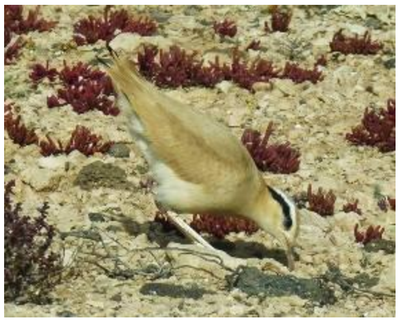
Cream-coloured courser feeding close to the minibus (KD)

The sun was still shining when we got back to the minibus, so the new bus shelter was the perfect place to have our lunch. Overhead we saw Egyptian vultures again, and several swifts appeared. Brief views suggested they were rather pale-throated and therefore pallid swifts, but they could just possibly have been the endemic plain swifts. Better views would have enabled us to identify them but they shot through and were never seen again.