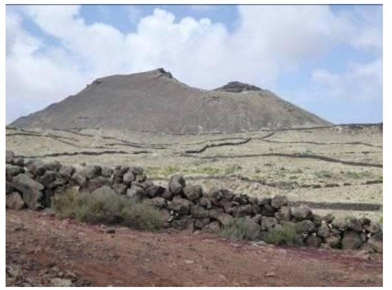
Lava field and the volcanic cone of Montaña Arena (DM)

After breakfast we gathered in the cactus garden that surrounds the hotel. There were plenty of handsome Spanish sparrows, and we noticed that one of the resident collared doves was paired to an African collared dove. This species is a recent colonist to the island, and the form here is recognisable as the 'Barbary' type by its very pale colour and red legs and eye.