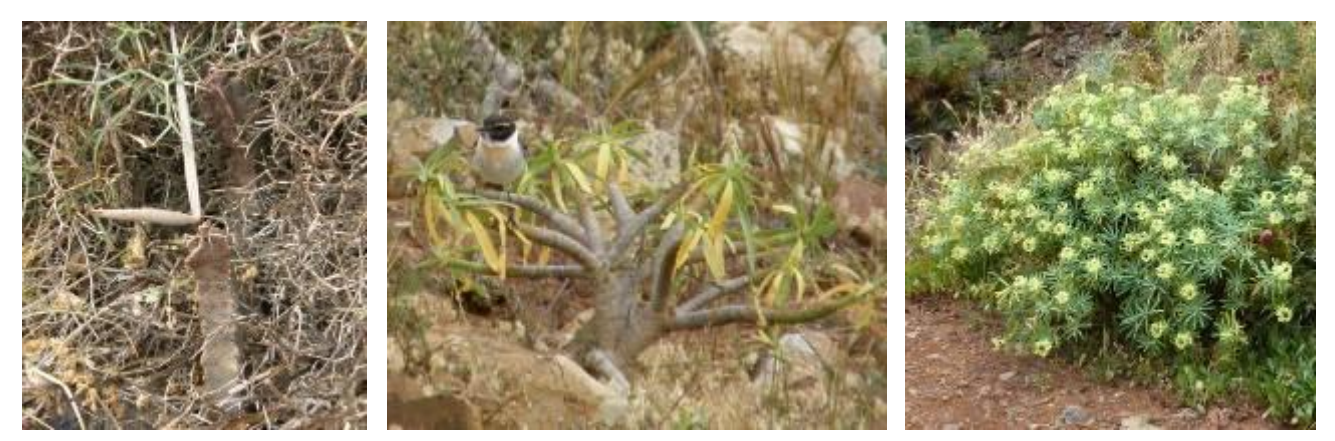
Caralluma burchardii, flowering finished and with long seed pods, growing beneath the savoury-smelling, Launaea arborescens (HC); Fuerteventura chat on Kleinia nerifolia, nicknamed 'crazy daisy' (HC); and Euphorbia regis-jubae, named in honour of King Juba II who is credited with discovering the Canary Islands in ancient times (MC)

Other interest was provided by our first hoopoe of the trip and views of a Barbary ground squirrel on a lava wall. Plants of note included the succulent Kleinia nereifolia , a bizarre relative of the ragwort, and the equally odd succulent fingers of Caralluma burchardii , a rare member of the milkweed family that is confined to a few places in the Eastern Canary Islands, with a closely related form on the Moroccan coast. It is not an easy plant to spot at first due to its stone-like colour and shape, but Helen soon got her eye in and was spotting clumps of it everywhere. A third succulent was Euphorbia regis-jubae with its yellow bracts. Spiny plants included Lycium intricatum with its edible red berries (beloved by houbara bustards and a range of other birds) and Asparagus pastorianus .