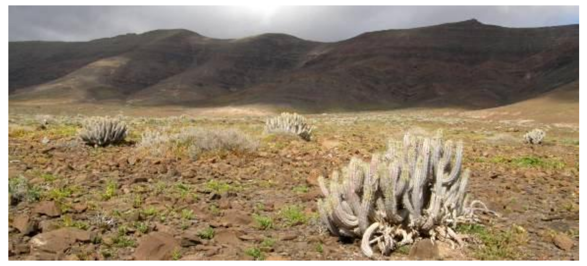
Jandia spurge and its dramatic setting (HC)

Lunch was at the woodland park at Costa Calma. Sadly, no migrants at all to be seen here so after lunch we pressed on to the isolated hotel at Los Gorriones. From a vantage point nearby we looked down over the tidal pools and saltmarsh where two spoonbills were the highlight. Four swallows heading west at least confirmed that some migration was happening.