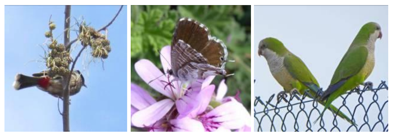
Three exotics: red-vented bulbul; geranium bronze, a South African species which has spread through the importation of pelargonium cultivars; and monk parakeet, which originates from South America and, like the ring-necked parakeet, adapts well to urban environments (JR)

The sun was hot now, so butterflies were active and we had very good views of geranium bronze. However, all the red admirals appeared to be the standard form and not the Canary red admiral (a subspecies of Indian red admiral). After a bit of effort we all had good views of the bulbuls, perhaps four or five in all. These are red-vented bulbuls, natives of southern Asia but seemingly well established here now and breeding wild in a small area in the south of the island.