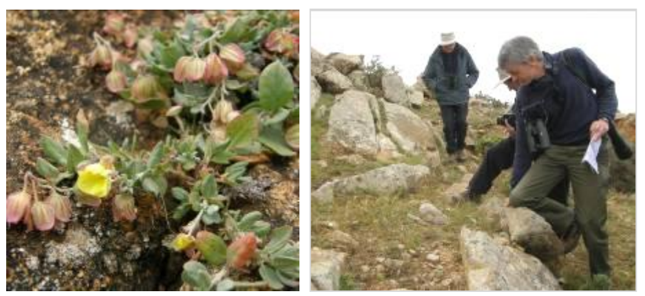
Admiring the tiny endemic Helianthemum thymiphyllum (HC)

The weather over Vega de Rio Palmas still looked poor, so we gave up on it for the day and instead headed north towards sunnier skies. We parked at the Mirador de Velosa and walked down a track on the high ridge to the east, with fine views over the island below. This area is above 2000 feet and the plants are different to those on the dryer ground below. They included the endemic vellow-flowered rock rose Helianthemum thymiphyllum.