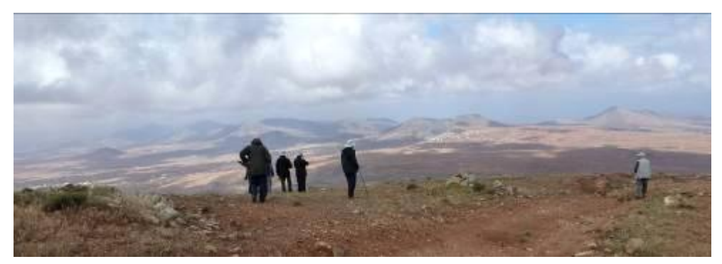
Admiring the view from the Mirador de Velosa

Group's favourite place – Las Penitas valley.