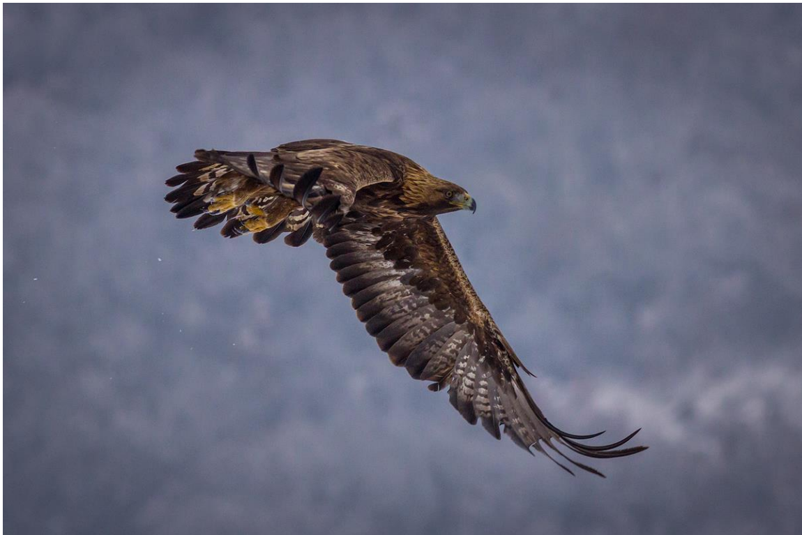
Golden Eagle hide photography

On the following day we had to enter and exit the hide in the dark. It was going to be a full day full of excitement. We had all the three birds landing at different times, two birds together, calls of the juvenile bird and very active behavior. We got what we wanted and still had a spare day.