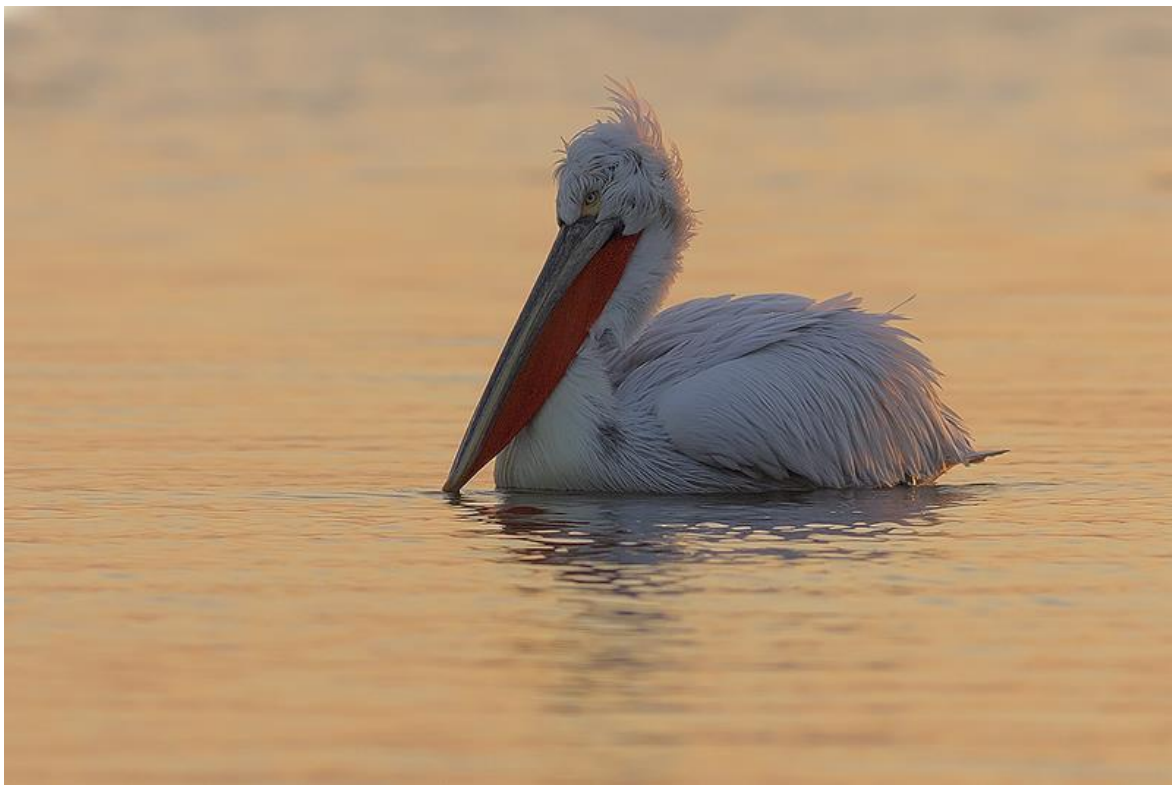
Dalmatian Pelican backlit