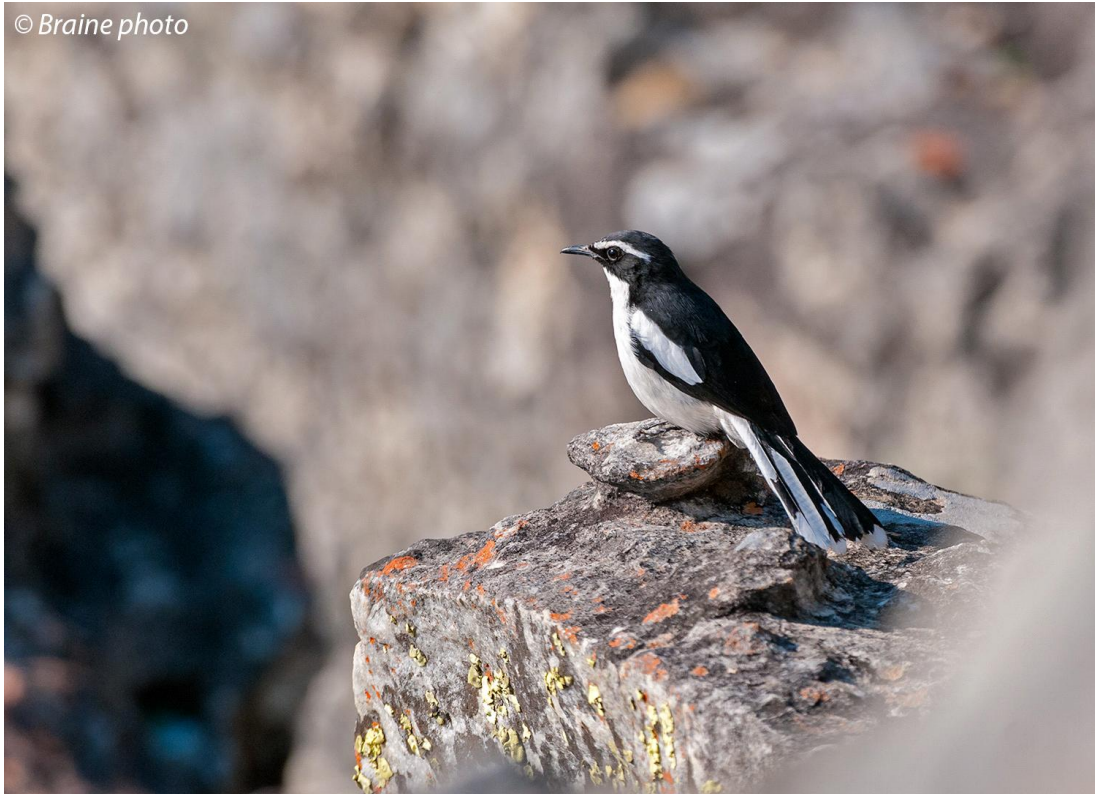
Angola Cave Chat

At 4:15am of the 30 th July we left toward the Cave Chat site which was a 1.5 hour journey to get there before sunrise. We climbed a short way through tough boulder strewn terrain and sat in wait along a vegetation line which the Cave Chat feeds along. We heard one calling across the opposite ridge at intervals, coming closer, when suddenly it popped up below us and provided splendid views. Around breakfast we saw Gabar Goshawk, Whit-bellied and Marico Sunbird. We continued to the closest water point in search of Cinderella Waxbill. We arrived and at first no sign but eventually heard them we then saw at least five of them. Continuing on toward the next water point we had around thirty Cinderella Waxbills drinking with Violet-eared waxbill, Green-winged Pytilia, Cinnamon-breasted Bunting, Red-headed Finch and Southern Grey-headed Sparrow. I had a brief view of one Lark-like Bunting but it didn't stick around for anyone else to see. Still couldn't believe we hadn't seen any yet. En route back to the lodge we saw Shikra and Wood Sandpiper. After lunch we had a short rest and went out on a boat cruise. Little bee-eater, White-backed Night Heron, Pied Kingfisher, Lesser-striped Swallow, Pied Wagtail and Water Thicknee were added. On the way back we encountered a number of Square-tailed Nightjar hawking insects along the river.