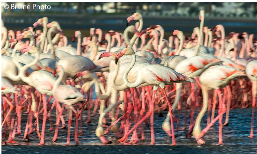
Greater and Lesser Flamingo

En route to Swakopmund we entered the dune area and located three very habituated Tractrac Chats who gave us very close views. After that we had a quick stop in Swakopmund and had a hearty meal at the Farmhouse Deli, where we had good views of Crowned and Cape Cormorants on the raft in the Mole while having our lunch. We also observed a school (pod) of Bottlenose Dolphins fishing in the bay. After lunch we tried for the Orange River White-eye in the Lovers Lane (promenade) area and managed to locate a pair providing great views. After lunch we headed towards the Swakop Salt works and very quickly located Gray's Larks. Notably not many over-wintering Palearctic migrants were present this year only a few Black-necked Grebe and several Common Greenshank with large numbers of Greater and Lesser Flamingo in Swakopmund and Walvis Bay. Although there are normally a few over-wintering Damara Tern, this year they didn't seem to be present and a quick stop at the bird island confirmed this. We decided to call it a day and headed back to Walvis Bay for dinner at the Raft.