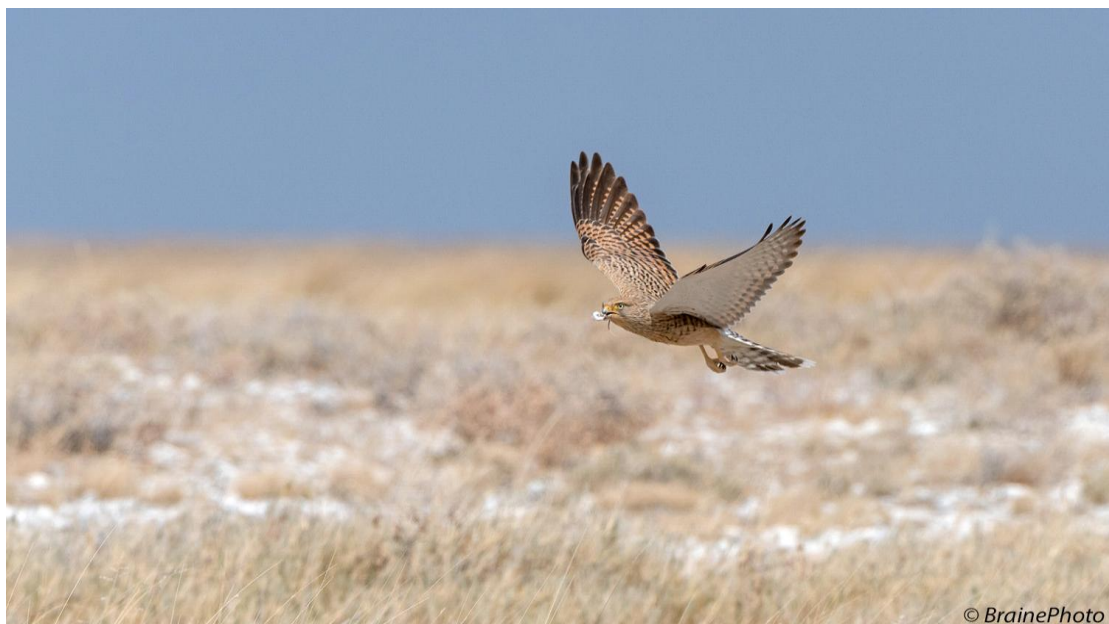
Greater Kestrel with Lizard lunch

A walk before breakfast on the 1 st August in search of Barred Wren-warbler produced Yellow-bellied Eremomela, Crimson-breasted Shrike, Ground-scraper Thrush, Chestnut-vented Tit-babbler and African Hoopoe. After breakfast we proceeded to Okondeka in the last hope of finding Stark's Lark. We located the same group of Burchell's Coursers from the previous day as well as Pink-billed, Red-capped, and Eastern Clapper Larks. Also we observed a pride of Lions with a large male as well as a female attempting to hunt. Many plains game and common bird species were seen en route to Halali. We finally found a large flock of Lark-like Bunting near Sueda. After check-in and lunch at Halali we did the Rhino drive loop in search of Ovambo Sparrow-hawk with no luck. Goas had a hybrid Shelduck, Egyptian Goose and another Southern Red-billed Hornbill was observed with Damara Hornbill. On arrival at camp I discovered a slow puncture in the tyre which I repaired.