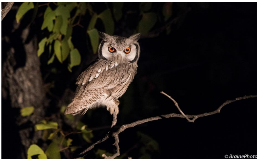
Southern White Faced Owl

Early morning on the 29 th we went for a drive and started off with six Lions chasing Black-backed Jackals off their zebra kill. We didn't see any new birds as it was pretty quiet out and the driest I can remember seeing the area. Many common plains game species were viewed though. At breakfast we had several Namaqua Sandgrouse come down to drink as well as Rüppell's Parrot, Rosy-faced Lovebirds and Speckled Pigeons. To this day we had still not seen one Lark-like Bunting or Stark's Lark which is very strange and just indicating the effect of this drought. We had a quick look for Bare-cheeked Babbler around the lodge but with no luck. We then found two groups on the way out of Hobatere. After a lunch stop near Ruacana we found a mixed group of Alpine, Little and Bradfield's Swift. A quick stop along the Kunene produced Malachite Kingfisher, Golden Weaver, Yellow-bellied Greenbul and Red-headed Weaver. The camp grounds provided brilliant views of Rufous-tailed Palm Thrush. After dinner we had an early night as we had to be up at 4am the next morning for the Angola Cave Chat trip.