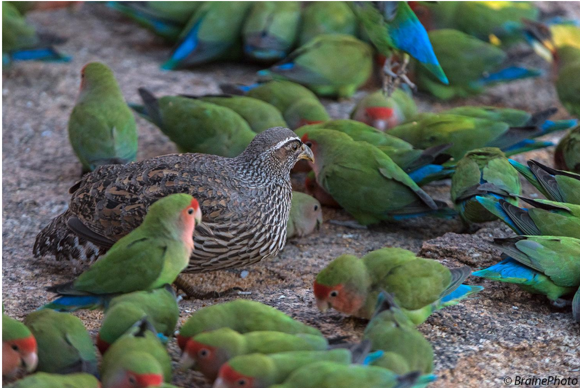
Hartlaub's Spurfowl and Rosy-faced Lovebirds