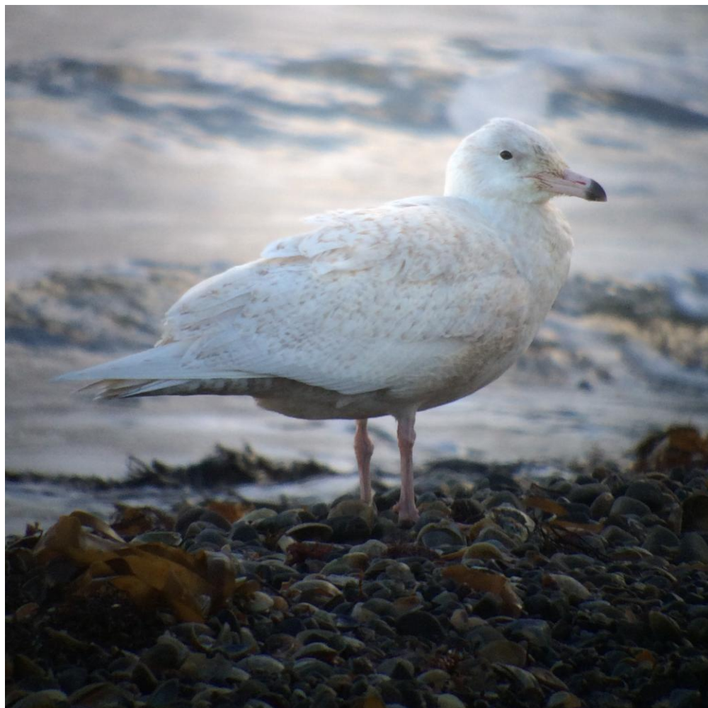
Glaucous Gull juv, Uiskentuie 18 th February

out two distant Long-tailed Ducks , lots of Common Eider and singletons of Common Scoter and Slavonian Grebe . Further west along the beach, we could see a white-winged gull loafing around, so we sped along for a closer look! The bird turned out to be a superb juvenile Glaucous Gull , and we ended up getting point blank views of it roosting on a shingle bar on the loch shore – but crikey it was cold here!