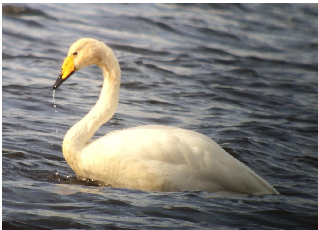
Whooper Swan, Loch Ardnave 17 th February