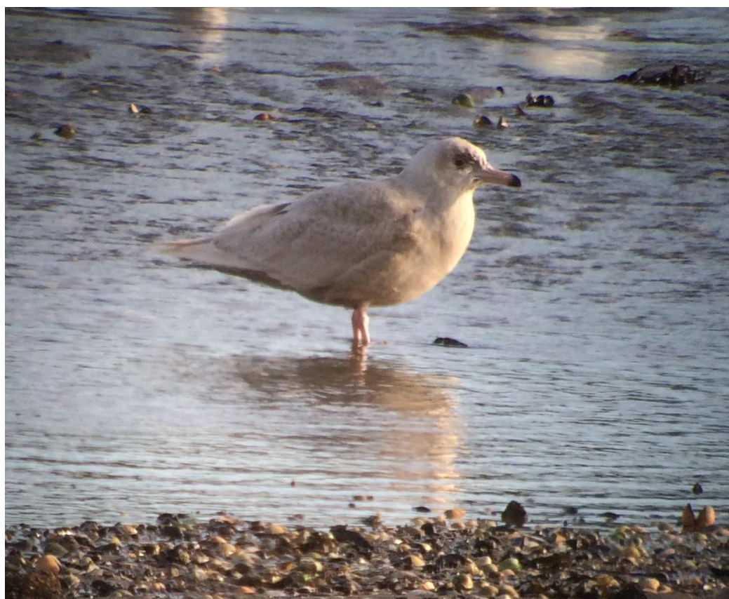
Glaucous Gull, Lochgilphead 15 th February

Reaching Port Askaig ahead of schedule, we were soon motoring across the island and of course, seeing our first flocks of geese! Barnacle , Greylag and Greenland White-fronted Geese were to be seen grazing in the roadside fields as we passed, and of course Hooded Crows and Common Buzzards were everywhere. After arriving at our cottages near Port Ellen, and getting everything unpacked, we had about an hour and a half of daylight remaining to make the most of. From our cottages, over a welcome cup of tea, we could scope a big flock of Fieldfares , see a pair of Reed Bunting and watch more Greenland White-fronted Geese grazing, before heading back up to Loch Indaal for a dusk