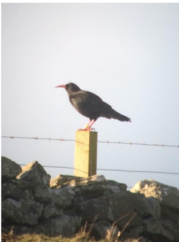
Golden Plover and Chough, Ardnave 17 th February