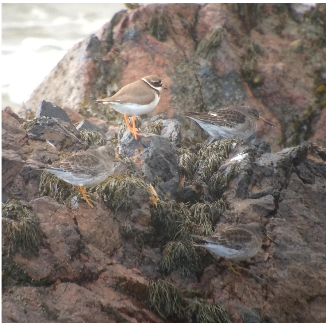
Purple Sandpipers and Ringed Plover, Bruichladdich 18 th February

The afternoon would be spent in the south of the isle, principally on The Oa peninsula, a wild and exposed headland which offers some of the most dramatic coastal scenery Islay has to offer. We sat out yet another sleet storm at the car park at the far end, but with a nice break in the weather then reaching in off the Atlantic, we set off on a circular walk up to the American Monument. A party of about thirty Twite were in the fields here, and Common Buzzard and Common Raven were frequent throughout the walk. At the top, as well as the spectacular views to Northern Ireland and the Rhinns of Islay, we heard the familiar call of the Chough and watched two birds tumble past us on the wind. Another six were seen a little further round the cliffs, where many hundreds of Northern Fulmar could also be observed on the rocks below. Distantly, looking back along the road from Port Ellen, two more Golden Eagles could be seen, hunting low over the fields at Coillabus for a good while – they would have been just above the road we had earlier driven down! We just completed our walk, as the heavens opened again – we had been lucky to dodge that one!