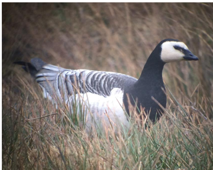
Barnacle Goose, Gruinart 16 th February

Next we headed up to Bunnahabhain, to check the small harbour there for Otter. A Great Northern Diver was floating close to the shore, but there was no sign of our quarry, so we retreated to the relative shelter of the Islay Mill on the Sorn River. Here many common woodland birds were around, including Coal Tit and Treecreeper, but we couldn't find any Dippers on the river – a spectacular flock of Barnacle Geese were in the fields behind the woods though. Coffee and cake was a welcome distraction, before we called in at Bridgend to use the toilets and there we bagged up a pair of Dippers by the bridge! The rain was relentless, so we decided to head up to the RSPB reserve at Loch Gruinart and make use of the hides there for a bit of shelter. This was probably the peak of the storm, as we could only open half the flaps for fear of the roof being ripped off by the wind! Nevertheless a nice selection of wildfowl included close views of Barnacle and Greenland White-fronted Geese , Common Teal, Eurasian Wigeon, Northern Pintail and a nice Whooper Swan . A couple of Common Snipe, two Red Knot and a party of Common Redshank were also noted, plus a single Skylark. We had to be brave in the end though, and battle our way back up to the car park!