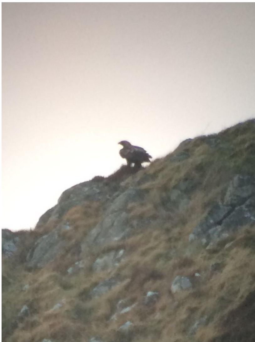
Golden Eagle, Claggan Bay 18 th February

and eventually it took flight to be joined by its mate, and we watched them disappear over the ridge – our 11 th goldies of the trip, and a great way to end the day.