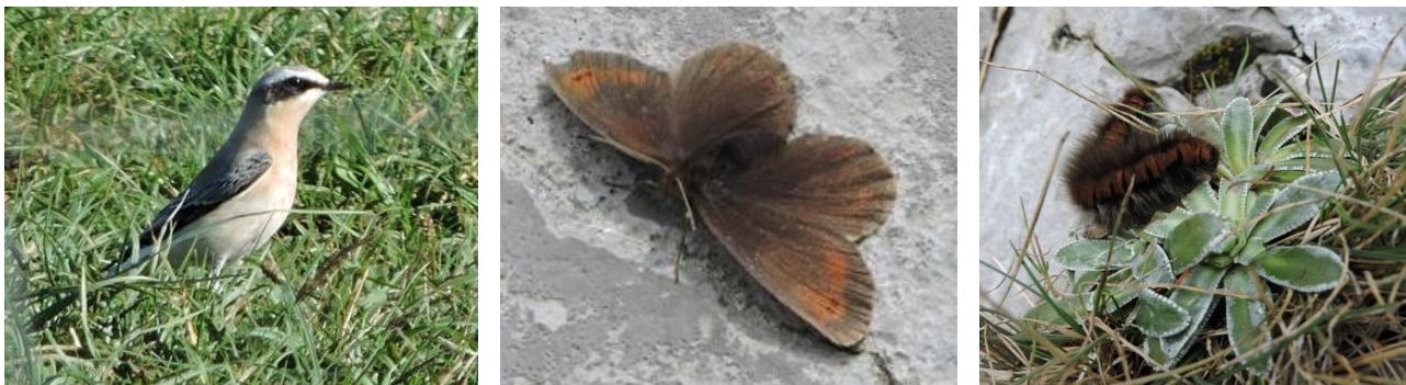
Wheatear (through a wire fence), Styrian ringlet and fox moth larvae on Host's saxifrage.

These enormous 'woolly bear' caterpillars are covered in irritant hairs and cuckoos are one of the few species that seem able to deal with this potential food source.