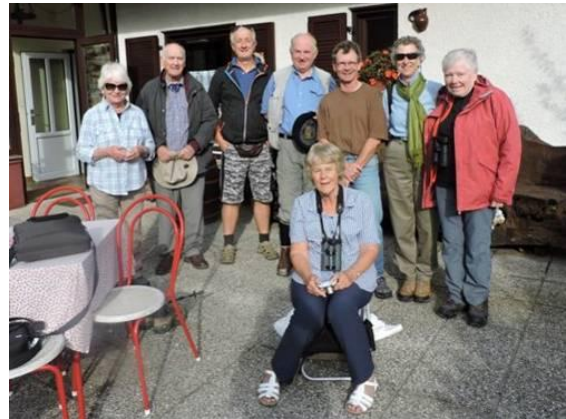
A trifle chilly at 2200m, and less chilly at 200m!

This holiday, as for every Honeyguide holiday, also puts something into conservation in our host country by way of a contribution to the wildlife that we enjoyed. The conservation contribution from this holiday, €400 (£320), went to DOPPS, BirdLife Slovenia.