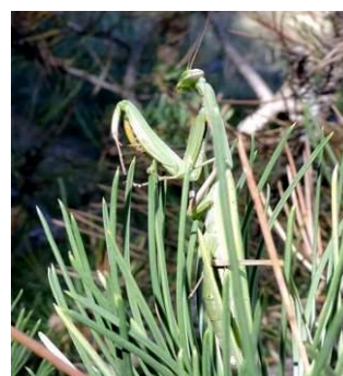
Hyssop, gall of the wasp Andricus quercustozae and praying mantis.