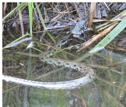
Pied flycatcher, pintails and grass snake.