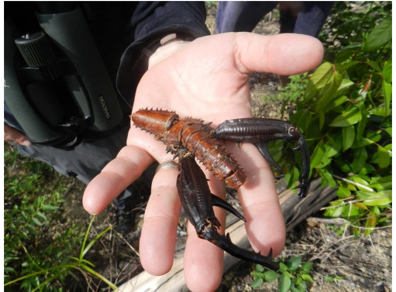
Figure 12 Remains of what is possibly a stick insect called Eurcantha calcarata

Shortly after, we were in a small streamside gully and Derrick was photographing the plant he was pursuing.