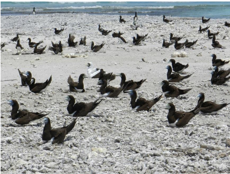
Figure 9 - Brown and Masked Boobies nesting

While boating between land points, the boys could not help throwing in a line and this just about always being rewarded. This afternoon, they hooked Skipjack Tuna and Trevally for our evening meal.