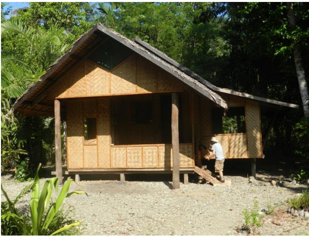
Figure 15 The recently completed dining area room at Sibonai.

Our guide, Waiyaki Nemani picked us up and then we drove out to East Cape to hook up with the banana boat that would take us out to Sibonai Guesthouse on Normanby Island. Along the way we managed to get a couple of species of Ant Plants growing on Pandanus in grasslands along the roadside.