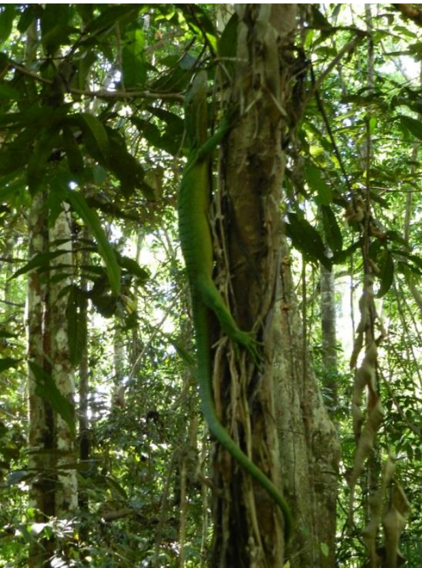
Figure 3 Emerald Monitor

We normally allowed about three hours to complete this ascent, but plenty of time had been allocated to carry out this rather exhausting walk. Derrick had decided that the walk was going to be too strenuous for him and opted to return to Hilltop Guesthouse.