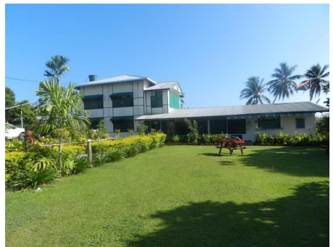
Figure 7 Bwagaoia Guesthouse

The afternoon was spent checking out around town, the picking up our food and water requirements for the next four day boating leg of our little adventure.