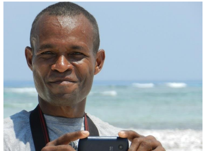
Figure 10 - Enoch fell in love with a particular baby Brown Booby

On arrival at Tagula Village we were presented our very first encounter with one of our three main target endemic species for this location, this being the Tagula Meliphaga . It was intended to camp at