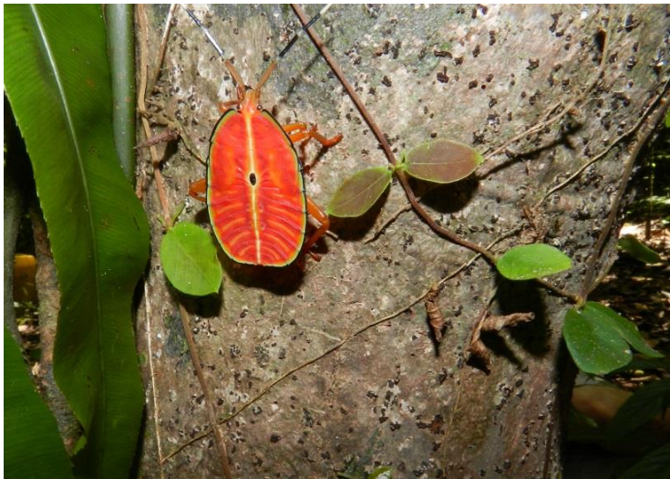
Figure 5 Some great bugs were also on offer.