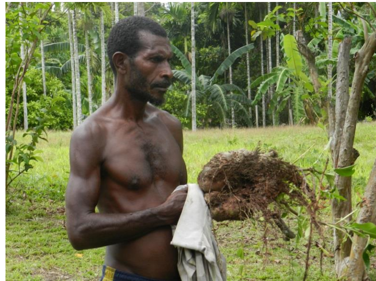
Figure 13 The man of the moment holding an Ant Plant. A big thank you to him!

We came ashore at Pambwa , an abandoned government station, as the guys knew that we could access freshwater here and we certainly wanted the opportunity to freshen up. Sitting nearby was a small group of chaps enjoying the local past-time of chewing Beetlenut and we wandered over for a chat.