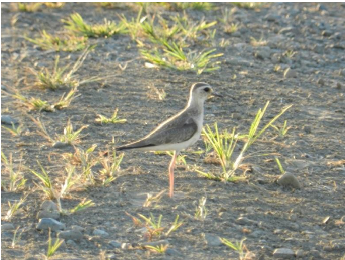
Figure 1 Oriental Plover

After breakfast we ventured off by road to our first temporary home, Hilltop Guesthouse near Saisaida Village in the Sagarai Valley . There was the opportunity to stop at several points along the way to allow us to add to our tick lists. No earth shattering species picked up, but we did get an Oriental Plover on the roadside in a recently planted Oil Palm plantation.