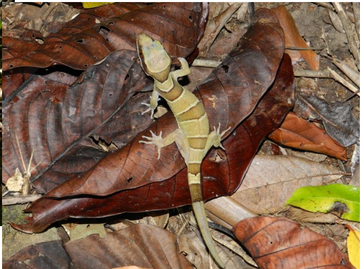
Figure 6 Bent-toed Gecko

as it appeared and the bird was in fact a Papuan Dwarf Kingfisher . Our conclusion being based on its size, general body colour and habitat in which it was encountered.