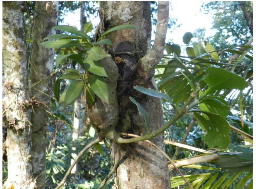
Figure 2 Ant Plant species

On finally getting to our bush campsite, we set up the tent and bedding for the night. The guys also created a seat, table and kitchen from the surrounding materials. While this was happening, Enoch got a Papuan Frogmouth for us to see.