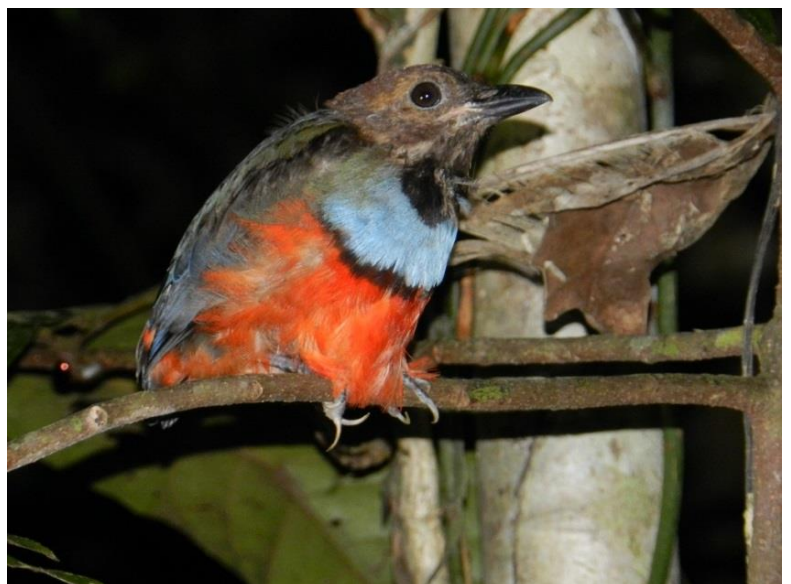
Figure 4 Red-bellied Pitta or Papuan Pitta

At the beginning of the walk we picked up several Glossy Ibis feeding along a rainforest lined river. These just looked out of place in this environment and were a first for me in Milne Bay itself. Other nice sightings on the way up included Palm Cockatoos , Blyth's Hornbills , a Variable Goshawk nest (With fledgling near-by) and a nice local variant of the Beautiful Fruit Dove . The icing on the cake in the non-bird