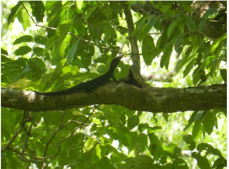
Figure 16 Bogert's Monitor up in canopy.

Waiyaki wandered off for a bit during the afternoon and on returning, informed us that he had got another look at the Pitta. Today was certainly the day for