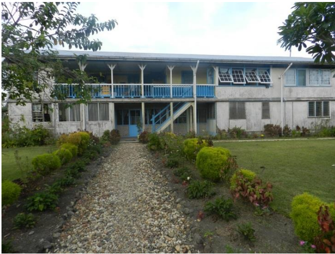
Figure 17 Maedana Guest House