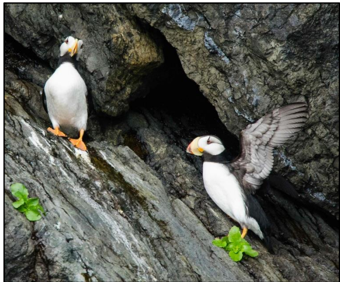
Horned Puffins

Like the majority of the guests that visit St. Paul, birds are the purpose for the visit. This year's group had great luck with Asian rarities, which are always a tantalizing draw to these islands. Migration here, depending on weather, can turn up some spectacular rarities! This year Common Greenshank, Wood Sandpiper, and Grey-tailed Tattler were all seen with varying degrees of satisfaction. The highlight of the Asian rarities seen was undoubtedly the gorgeous male Siberian Rubythroat that was located the day before, and stayed throughout our clients' time there. As a skulker by nature, the clients' perseverance managed to land them some fine views.