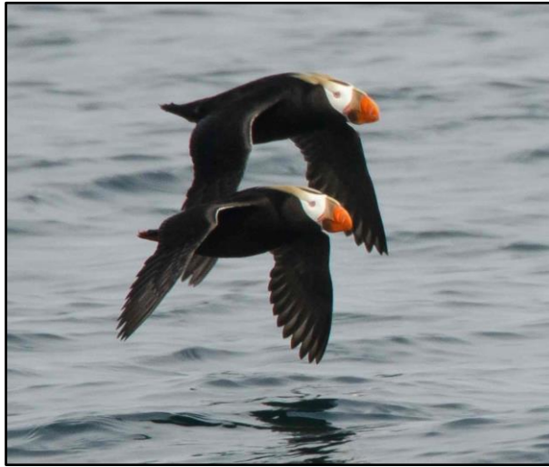
Tufted Puffins by Forrest Rowland

adventure, across hundreds of miles of tundra, boreal forest, coastal mountains, and islands, is unlike anything that can be experienced anywhere else on Earth. There simply is no parallel to Alaska.