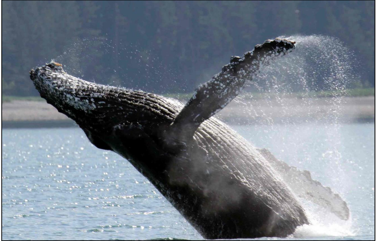
Humpback Whale

This was the inaugural run of the full suite of Alaskan tours for us at Rockjumper. We hope you enjoyed your time with our guides as much as they did with you all, in the field, seeing some of the best birds and wildlife in North America.