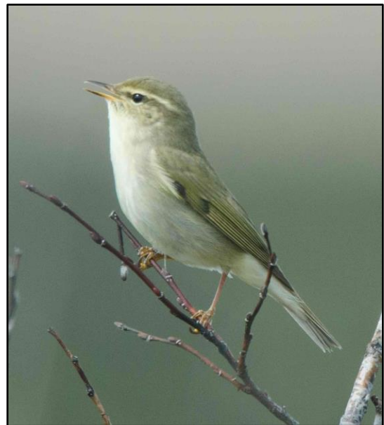
Arctic Warbler

The following three days were spent on the famed Denali highway. This nearly 150-mile stretch of gravel road courses through Boreal forest, up into the Alaska Range across pristine taiga and dry tundra, dotted with lakes and ponds, offering some of the most magnificent scenery on Earth. The birding along the road is fabulous as well! Red-throated and Common Loons, Trumpeter and Tundra Swans, Barrow's and Common Goldeneyes, Red-breasted and Common Mergansers, Bufflehead, and Surf Scoter, were among the numerous species of waterfowl encountered on the high lakes. The Boreal forest areas afforded us great looks at: Blackpoll, Wilson's, Myrtle (Yellow-rumped) and Yellow Warblers, Northern Waterthrush, Grey-cheeked and Swainson's Thrushes, a few Bohemian Waxwings, great views of a group of White-winged Crossbills