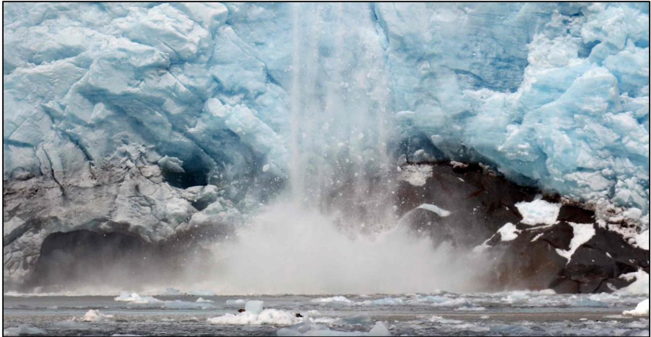
Calving Glacier

the call over, with an ear-to-ear smile on her face, “I’ve got one!” Indeed she did - a female White-tailed Ptarmigan, incubating eggs, right at her feet. As usual, the bird didn’t budge an inch. We backed away to enjoy leisurely views of this confiding bird, the only Ptarmigan endemic to North America.