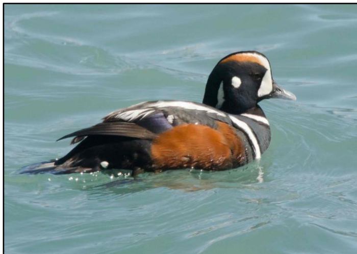
Harlequin Duck

On our way back from the Denali Highway to Anchorage, we made several stops in search of Northern Hawk Owl, to no avail. Olive-sided and Alder Flycatchers were a pittance, though we decided that there was enough time to run up Hatcher Pass, in a longshot attempt at White-tailed Ptarmigan. The Ptarmigan trifecta/hat-trick is a mythical event seldom, if ever, pulled off on one tour. We already had Willow and Rock in the bag, and a strong will to make up for missing the