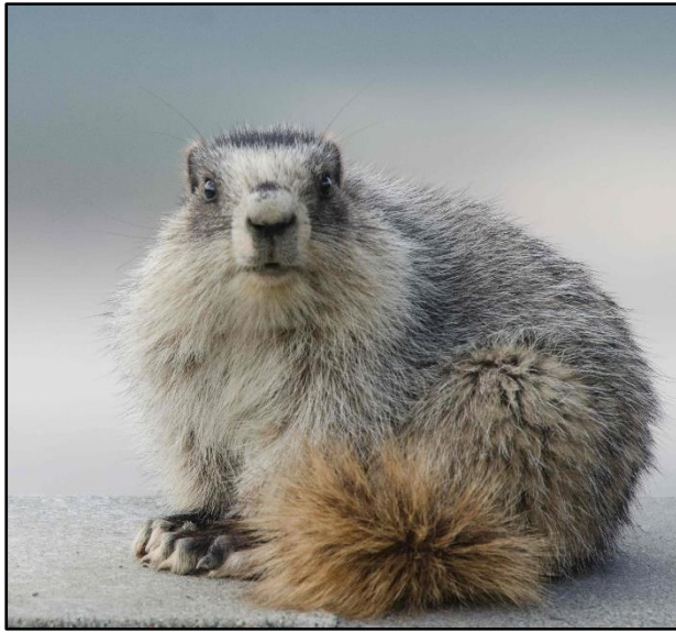
Hoary Marmot by Forrest Rowland

Less than 1/3 of the visitors to Denali actually get a view of the peak - clouds, rain and snow are common throughout the year. As we cruised up through the boreal forest and taiga towards the tundra, several stops were made to enjoy the majesty of Denali - which was completely sunlit. Unhindered views of Denali were, perhaps, the highlight of our time in the National Park. Of course, birding was good too! Gyrfalcon topped the list of species, though Long-tailed Jaeger and numerous Golden Eagles were also good finds. The avian highlight in the park was possibly a Black-billed Magpie attempting to rob the nest of Willow Ptarmigans on the roadside, while we all watched anxiously. After several minutes of serious drama, the Ptarmigans prevailed and the Magpie gave up!