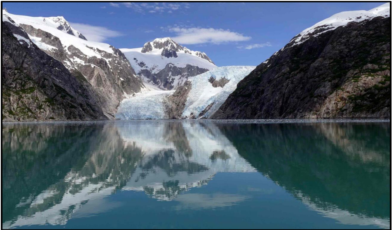
Scenic Alaska by Sid Padgaonkar

Denali & Kenai Peninsula - 5 th to 13 th June 2016 (9 days)