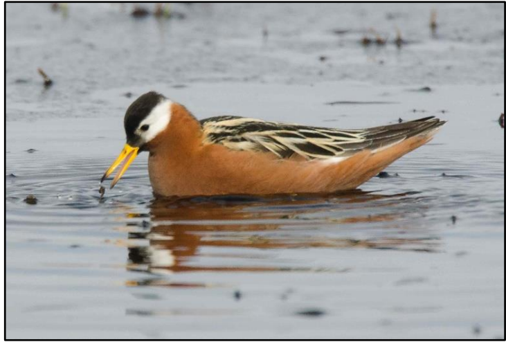
Red Phalarope

The infrastructure and way of life in the not-so-small town of Barrow is fascinating. From how lumber and supplies arrive to such a distant outpost, to the simple price of windshield washer fluid ($25/gallon!) is bizarre and interesting. The surrounding terrain and birds that inhabit this strange landscape are equally unique. Though we had relatively little time there, in truth there is very little access to the surroundings here, with only one improved road reaching about 40kms from town.