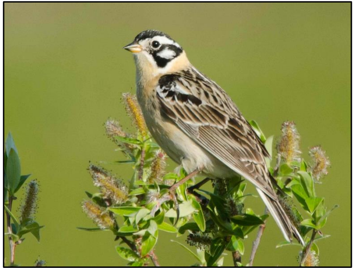
Smith's Longspur by Forrest Rowland

Breeding shorebirds, especially the showy American Golden Plovers, Red Phalaropes and Long-billed Dowitchers, were wonderful. Seeing these lovely species as they should be - extravagant and gorgeous in their breeding attire - is part of what makes Barrow so special. Some clients could scarcely believe that the bright red shorebird they were seeing was actually a Sanderling - not white, not pebbly-grey, but bright red! Migration was still in full swing, and provided some incredible experiences, such as seeing more than 40 Pomarine Jaegers in a morning, and tallying over 1,000 Common Eiders coming in groups of 50 to 100 as they headed North around The Point. King Eider was incredibly well represented, too, in all its splendid plumage. Though we enjoyed several individuals in ponds and lakes nearby, seeing flocks of 40 to 60 cruising past us, just beyond the shore ice, was outstanding!