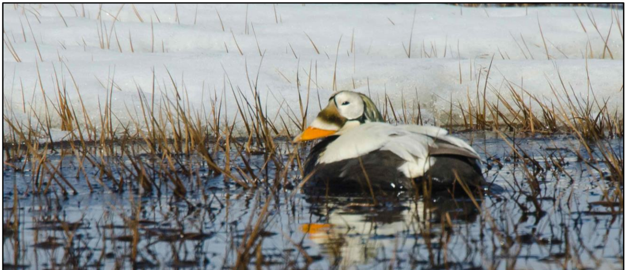
Spectacled Eider by Forrest Rowland

Spectacled Eiders, Ivory Gulls, and Snowy Owls withstanding, a visit to Barrow is a unique experience for whatever motive. Whether it may be looking out across shore and pack ice in the Arctic Sea, walking (aka stumbling) across the bizarre, uneven, rocky yet soggy tundra, or driving