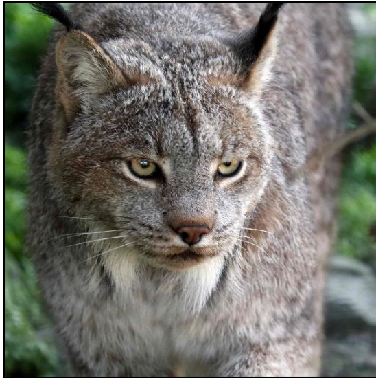
Canadian Lynx by Sid Padgaonkar

well. Opting to tackle Kougarak Road on the first morning, we headed out after a leisurely breakfast and, within very little time, we were enjoying views of a displaying male Bluethroat! This insanely beautiful bird not only looks flashy, but has an incredible towering flight display that it did, repeatedly, for us. Red Fox Sparrows, Golden-crowned Sparrows, all of the resident warblers, Golden Eagle, and several other species fell into line.