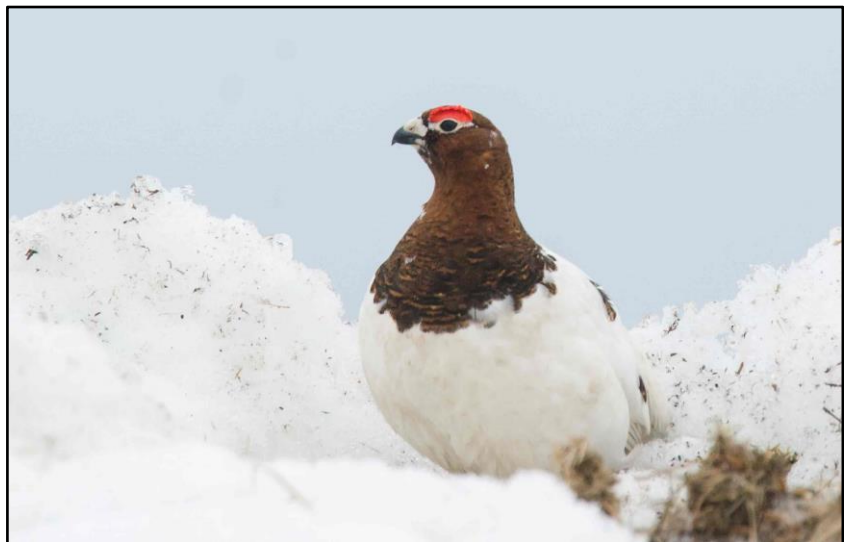
Willow Ptarmigan

Later that evening we made our first of three fruitless ventures in search of a pair of Emperor Geese keeping company with the Brant in the Sound off Council Road. Distance, tide, and shockingly-high howling winds were against our efforts at anything but very sketchy, super-distant views of these non-tickable creatures - which we knew were lurking almost within grasp. Our efforts were compensated for by: Rusty Blackbirds, Black Turnstones, several Short-eared Owls, two Eastern Yellow