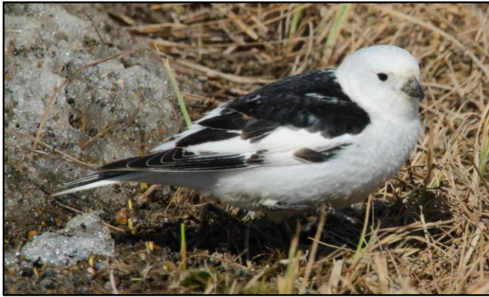
Snow Bunting by Forrest Rowland

No matter the weather, or which Asian birds turn up, a visit to the islands in spring is absolute magic: Auklets, Murres, Fulmars, Kittiwakes, Puffins, and Cormorants numbering in the millions come to the islands for breeding season. Parakeet, and incomparably cute Crested Auklets are amongst the most abundant - though gauging abundance on cliffs where any given square meter might be home to 3 or more nesting species can prove to be challenging! The density on the cliffs is spectacular. Horned and Tufted Puffins are common, though both