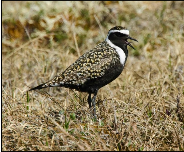
American Golden Plover

starting to understand just how imperiled this species is. We counted ourselves incredibly lucky to have one come flying past us, on its way out to the pack ice.