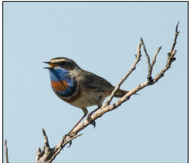
Bluethroat by Forrest Rowland

Our very first day out was perhaps our most brilliant - though Teller Road also treated us