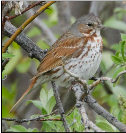
Red Fox Sparrow by Forrest Rowland

Wagtails, and a BELUGA! Pulling over at the point for a – ahem - private moment behind a gravel mound, up popped the white whale. We enjoyed a lengthy 5-10 minute observation of this enigmatic creature as it swam within a few meters of the rocky shore.