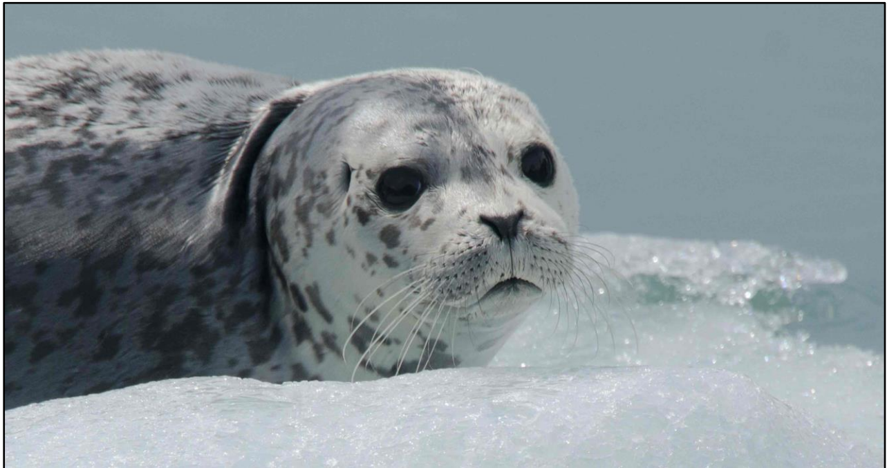
Harbour Seal by Forrest Rowland

It would be very difficult to accurately describe a tour around Alaska - without drowning the narrative in superlatives to the point of nuisance. Not only is it an inconceivably huge area to describe, but the habitats and landscapes, though far north and less biodiverse than the tropics, are completely unique from one portion of the tour to the next. Though I will do my best, I will fail to encapsulate what it's like to, for example, watch a coastal glacier calving into the Pacific, while being observed by Harbour Seals and on-looking Murrelets. I can't accurately describe the sense of wilderness felt looking across the vast glacial valleys and tundra mountains of Nome, with Long-tailed Jaegers hovering overhead, a Rock Ptarmigan incubating eggs near our feet, and Muskoxen staring at us strangers to these arctic expanses. Finally, there is Denali: squinting across jagged snowy ridges that tower above 10,000 feet, mere dwarfs beneath Denali standing 20,300 feet high, making everything else in view seem small, even toy-like, by comparison. The birds, Caribou, even Moose seem like miniature figurines against the rugged mountains and endless valleys of this, one of the most remote wildernesses on the planet. The numerous, amazing birds, and our memorable encounters with them are just a small part of what makes Alaska special. The journey, and