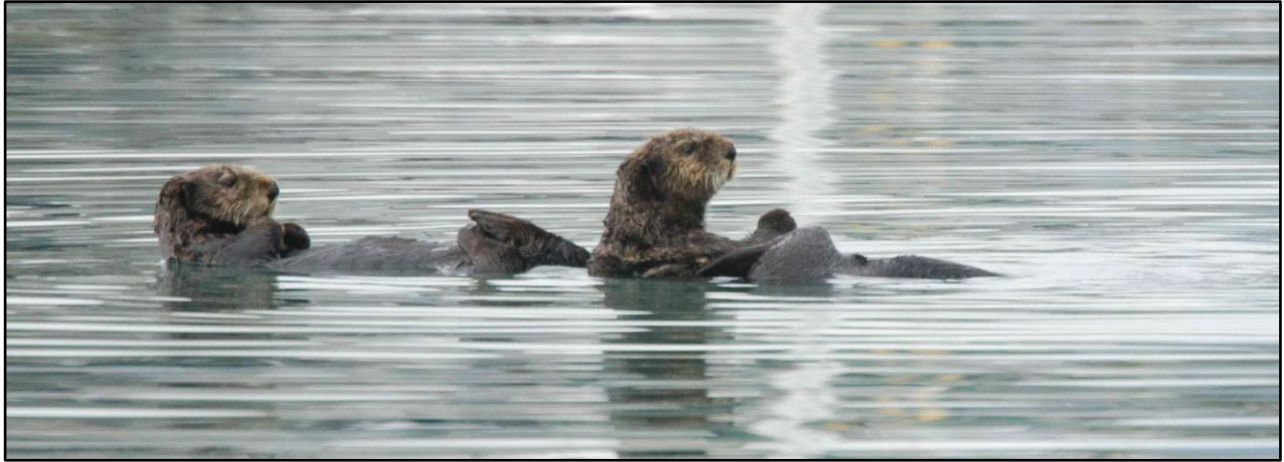
Sea Otters by Forrest Rowland

cavorting in nearby treetops, and many Red Fox Sparrows.